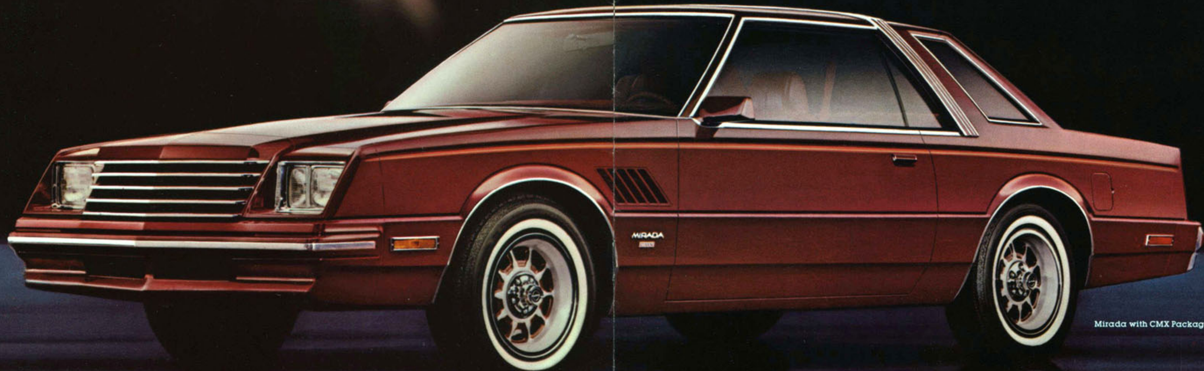
Mirada with CMX Package in Baron Red

From your first look at Mirada, you know you haven't seen this one before. Everything about it—the aerodynamic profile, the one-of-a-kind front end, the striking roof motif—says that this is no ordinary car. Now slide behind the wheel and get ready to forget everything that's commonplace about driving. The sensation of free flight is instantaneous. The feeling of being unique among drivers is unmistakable. Mirada. Total Performance in a personal car!