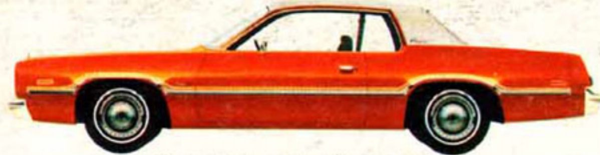
CORONET BROUGHAM 2-DOOR HARDTOP

FORM NO. 81-205-5004 LITHO IN U.S.A. 8/74