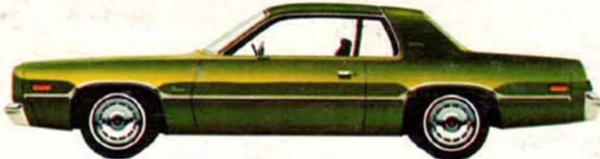
CORONET CUSTOM 2-DOOR HARDTOP