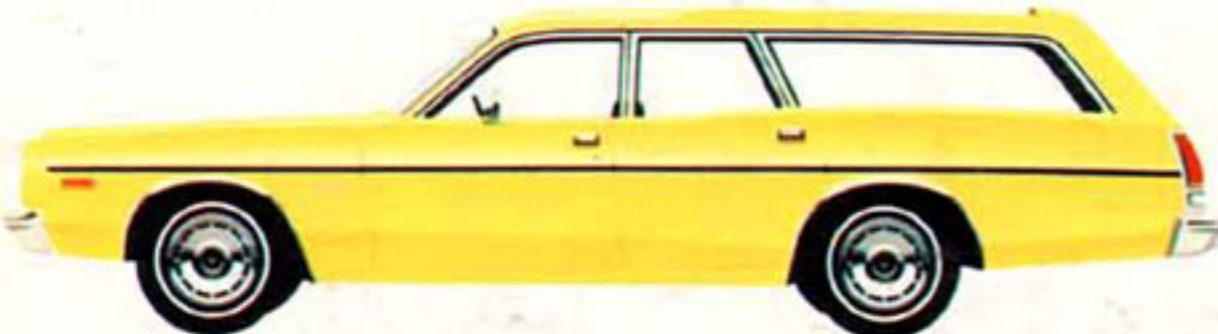
CORONET CUSTOM WAGON