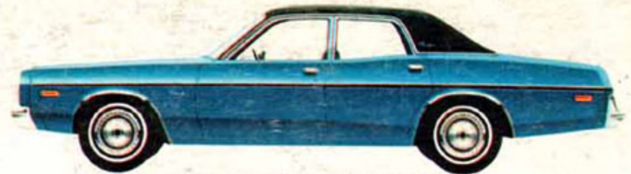
CORONET BROUGHAM 4-DOOR SEDAN