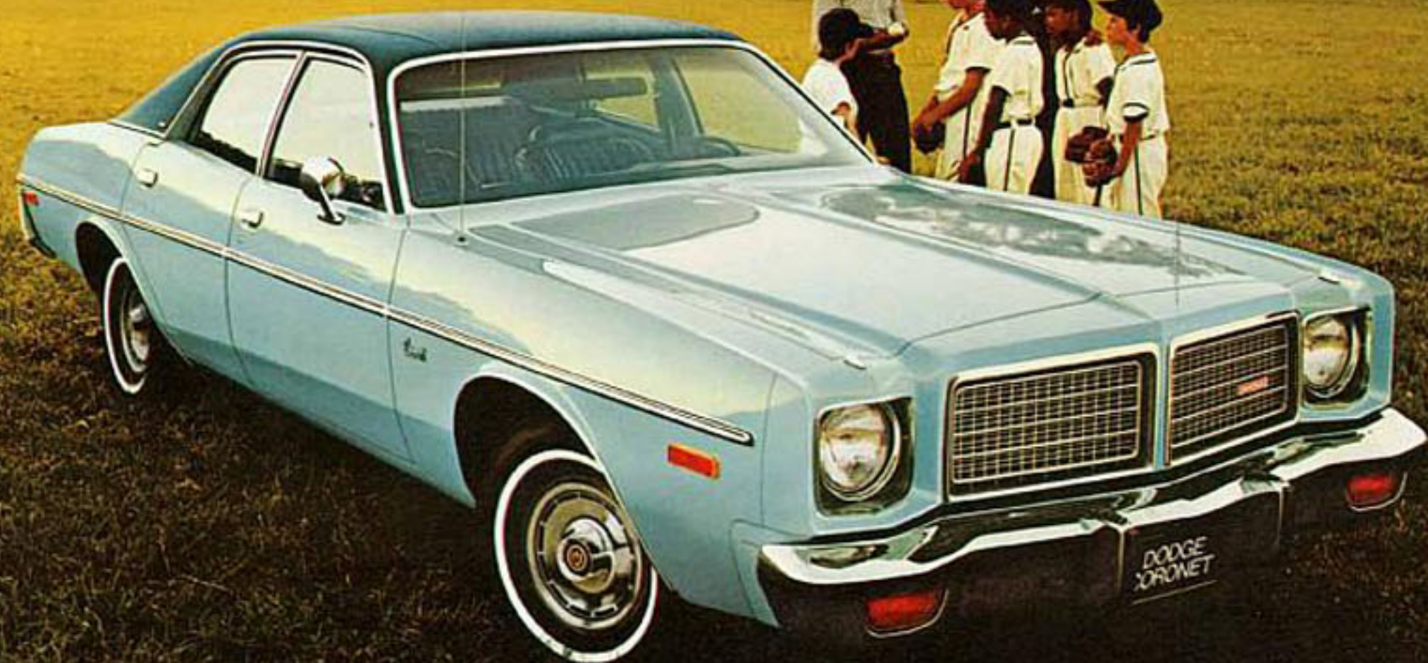
CORONET CUSTOM 4-DOOR SEDAN.

Value. It means different things to different families. To some, it means comfort. To others, operating economy. And to still others, price. For 1975, we feel our Coronet sedans represent many different kinds of values.