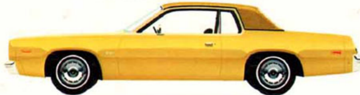
CORONET 2-DOOR HARDTOP