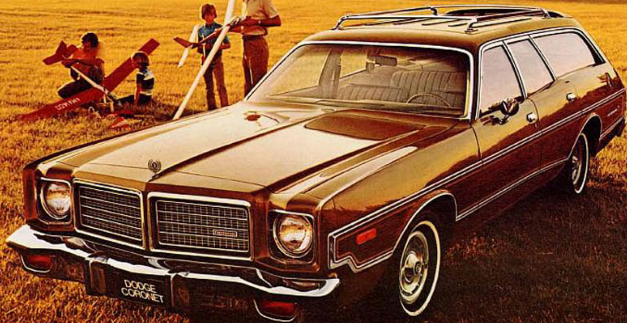
CORONET CRESTWOOD 3-SEAT WAGON.

Meet the happy mediums. The 1975 Coronet wagons. They're trim on the outside, but roomy, the way people expect wagons to be, on the inside. Just load one, and you'll see what we mean. Coronet's generous 86.8 cubic feet of cargo space can handle big loads. You can lay four-by-eight-foot building panels flat on the floor—even with the tailgate closed! That's something you can't do with some mid-sized wagons. And isn't room one of the major reasons you're considering a wagon?