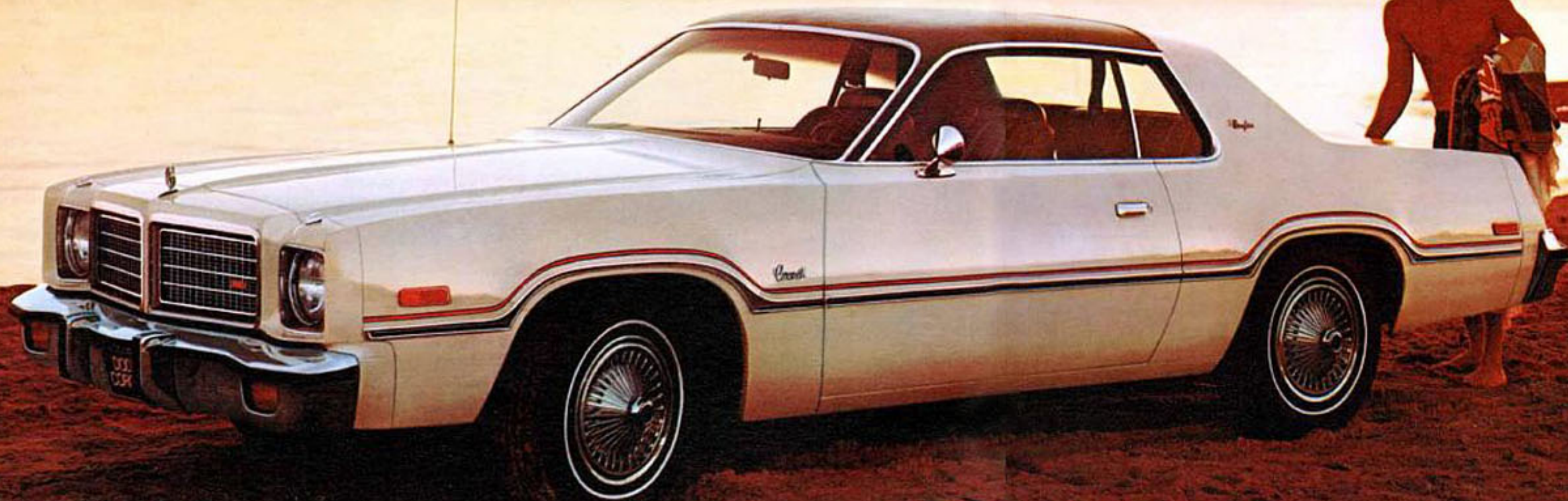
CORONET BROUGHAM 2-DOOR HARDTOP.

CORONET HARDTOP. Welcome, savers. This is our lowest priced Coronet two-door. Yet it's equipped with many of the same features you'll find on our most expensive models. There's the solid strength of Unibody construction. The stability of torsion-bar suspension. Plus the time and money-saving Electronic Ignition System. Want more? Just turn the page.