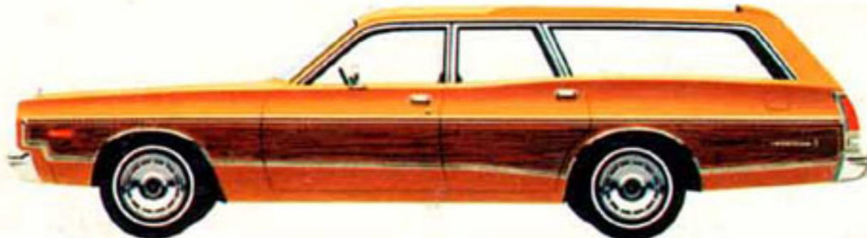
CORONET CRESTWOOD WAGON