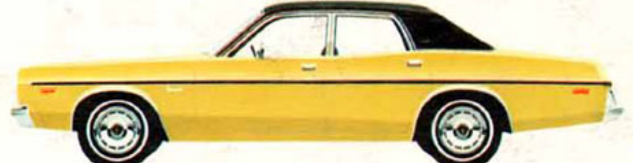
CORONET CUSTOM 4-DOOR SEDAN