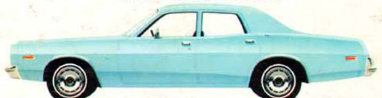
CORONET 4-DOOR SEDAN