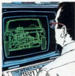
Finite element computer design technology.

Some of the equipment shown or described throughout this publication is available at extra cost.