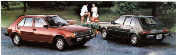
Colt Custom LS five-door shown in Dark Red.