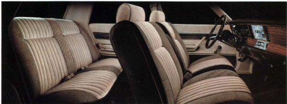
Reliant Special Edition interior shown in Brown and Beige cloth.