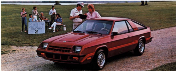
Turismo 2.2 shown in Crimson Red with Red cloth-and-vinyl bucket seat interior.