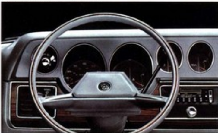
Voyager sport instrument panel shown in Silver.