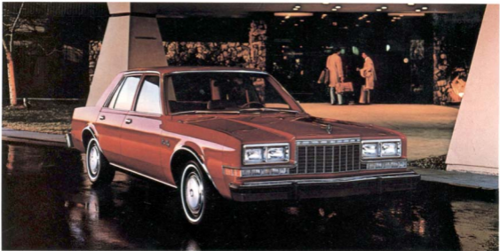
The Gran Fury shown in Crimson Red with Red cloth-and-vinyl interior.