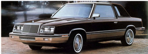
LeBaron two-door shown in Sable Brown/Beige Crystal Coat with Brown vinyl roof

*EPA estimates for LeBaron two-door models. Use EPA EST MPG numbers for comparison. Your mileage may differ depending upon speed, weather and trip length. Actual highway mileage will probably be lower than highway estimate. In California [28] EPA EST MPG. 44 estimated highway. Ask your dealer for EPA EST MPG ratings of other LeBaron models.