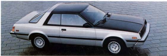
Black and Silver Sapporo "Technica."