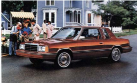
Reliant Special Edition two-door shown in Crimson Red.