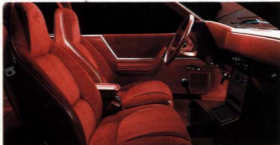
Turismo 2.2 standard interior with optional freestanding armrest shown in Red.