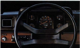
Horizon Custom instrument panel in Blue with woodtone trim.