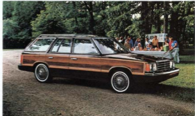
Reliant Special Edition station wagon shown in Sable Brown with woodgrain body side and moldings.