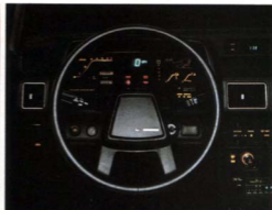
Sapporo's "Technica" instrument panel shown in Black.