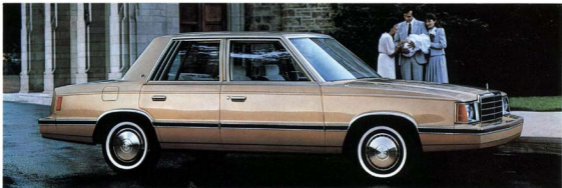
Reliant Special Edition four-door shown in Beige Crystal Coat.

*EPA estimates for Reliant two-door and four-door models. Use EPA EST MPG numbers for comparison. Your mileage may differ depending upon speed, weather and trip length. Actual highway mileage will probably be lower than highway estimate. In California, 28 EPA EST MPG, 40 estimated highway. Ask your dealer for EPA EST MPG ratings of wagon models.