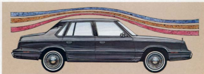
Aerodynamic styling results from extensive wind tunnel testing.