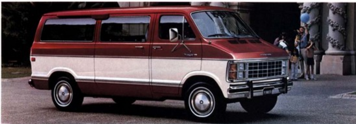
Voyager in Crimson Red and Pearl White

*Use EPA EST MPG number for comparison. Your mileage may differ depending upon speed, weather and trip length. Actual highway mileage will probably be lower than highway estimate. California mileage: \square EPA EST MPG, 45 estimated highway.