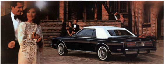
Cordoba shown in Nightwatch Blue with optional simulated convertible Cabriolet Roof Package.