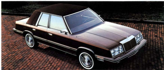
LeBaron four-door shown in Sable Brown with Brown vinyl roof