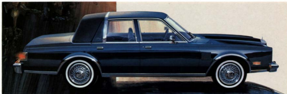
The Chrysler New Yorker Fifth Avenue Edition shown in Nighthatch Blue with Dark Blue landau roof.

Luxury disappeared? Test-drive the Chrysler New Yorker Fifth Avenue Edition and find out what the talking is all about.