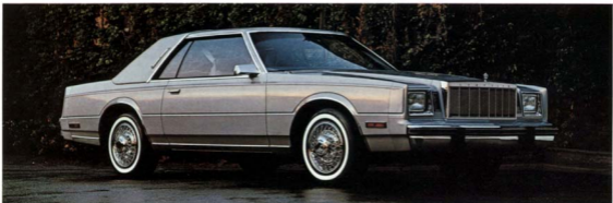
Chrysler Cordoba shown in Silver Crystal Coat with a Silver landau roof and optional wire wheel covers.

Cordoba is a car designed to be driven, and engineered to be enjoyed. Now is the time to make your move. Test-drive Chrysler Cordoba... and watch your personality come alive.