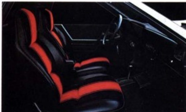
Scamp GT's standard cloth-and-vinyl high-back bucket seats in Black and Red.