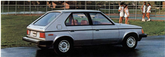
Plymouth Horizon shown in Silver Crystal Coat.