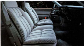
Cordoba's standard Monterey cloth-and-vinyl 60-40 seat shown in Silver.