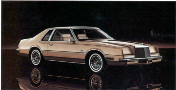
Imperial 1983 in Beige Crystal Coat

If you're looking for a car that has proven itself to be the American way to get your money's worth, test-drive Gran Fury.