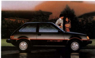
Colt Custom RS three-door shown in Black with Red trim.

Test-drive 1983 Sapporo. Then try to tear yourself away.