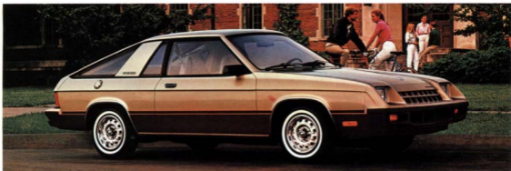
Plymouth Turismo shown in two-tone Beige Crystal Coat and Sable Brown.

†Use EPA EST MPG numbers for comparison. Your mileage may differ depending upon speed, weather and trip length. Actual highway mileage probably will be lower than highway estimate. In California: \frac{52}{53} EPA EST MPG; 53 estimated highway.