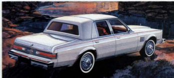
New Yorker Fifth Avenue Edition in Pearl White with landau roof.