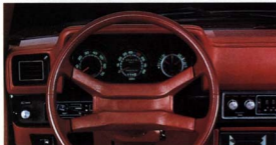
Turismo 2.2's instrument panel underscores its performance capabilities with a complete array of gauges and controls.