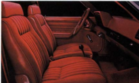
Plymouth Horizon standard interior with low-back cloth seats with dual recliners shown in Red.