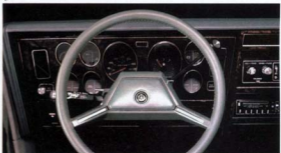
The luxury touch of Cordoba's optional leather-wrapped steering wheel.