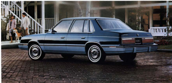
Chrysler E Class four door sedan shown in Nightmatch Blue/Glacier Blue Crystal coat two-tone