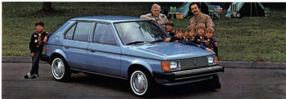
Horizon Custom shown in Glacier Blue Crystal Coat.

†Use EPA EST MPG numbers for comparison. Your mileage may differ depending upon speed, weather and trip length. Actual highway mileage probably will be lower than highway estimate. In California: 32 EPA EST MPG, 53 estimated highway