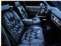
Optional leather interior shown in Dark Blue with 60/40 seating.