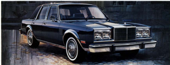
Another View. The Chrysler New Yorker Fifth Avenue Edition in Nighthatch Blue with Dark Blue landau roof.