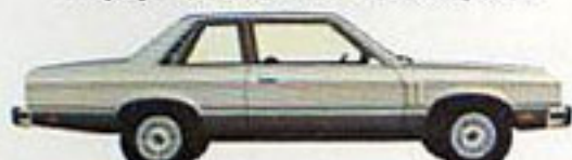
Zephyr 2-door sedan w/ES Type