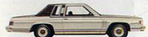
Grand Marquis 2-dr. sedan