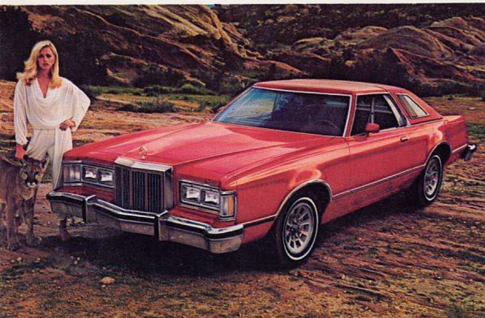
1979 Mercury Cougar XR-7