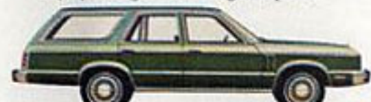
Zephyr Station Wagon