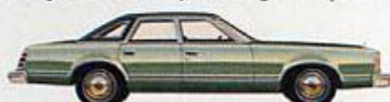
Cougar 4-dr. pillared hardtop w/Brougham Option