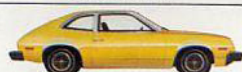
Bobcat 3-dr. Runabout