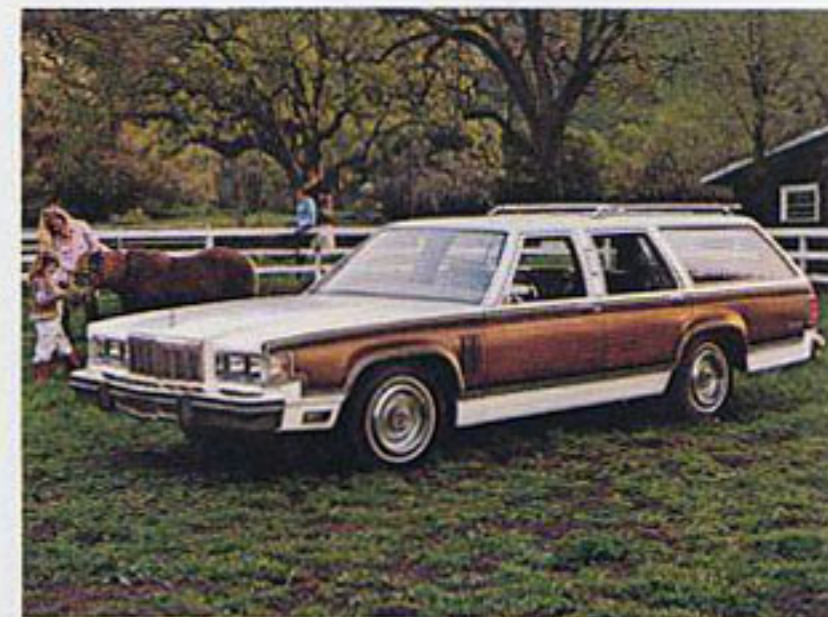
1979 Mercury Marquis Colony Park Station Wagon

Above: The Grand Marquis standard interior in optional dove grey leather-and-vinyl trim.