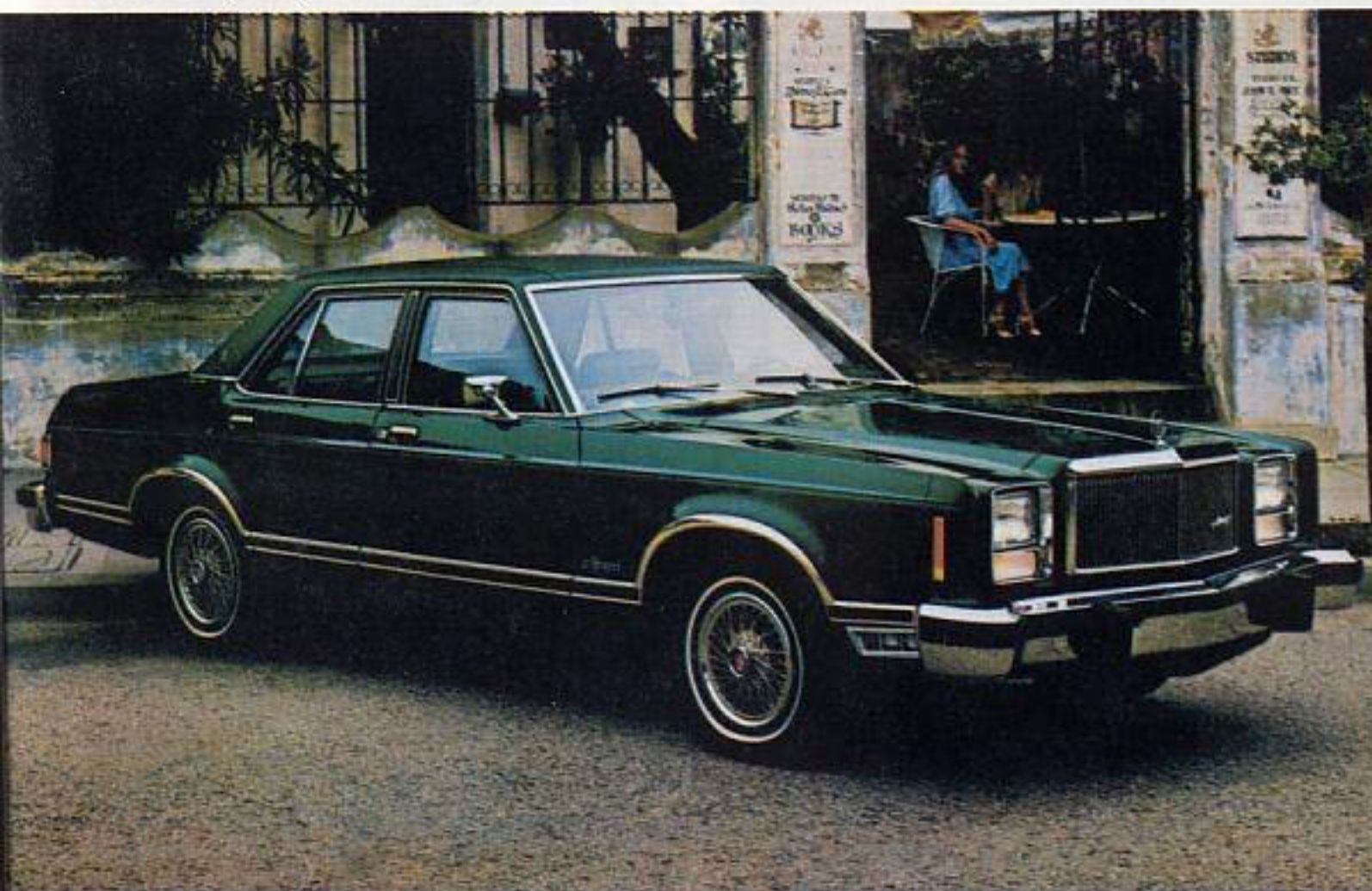
1979 Mercury Monarch 4-door w/Ghia Option