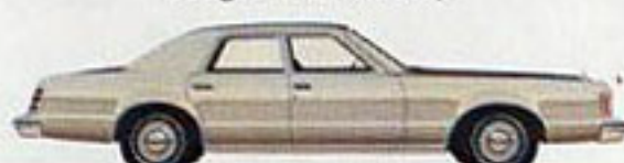
Cougar 4-dr. pillared hardtop