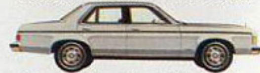
Monarch 4-dr. sedan with ESS option