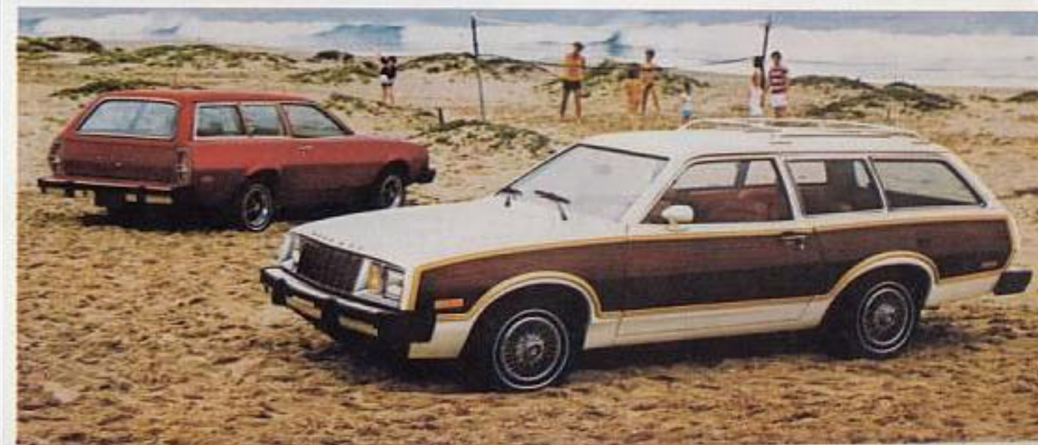
1979 Mercury Bobcat wagon and Bobcat wagon w/Villager Option

Pictured above are two glamorous versions of the Bobcat 3-door Runabout. In the foreground you see Bobcat with the Sports Package Option, and, in the background with the Sports Accent Option. Then there's Bobcat Wagon and Bobcat Wagon with Villager Option shown below. A choice in interiors, too. Shown left is the standard high-back bucket seat in black vinyl. Low-back bucket seats are also available in all-vinyl or cloth-and-vinyl.