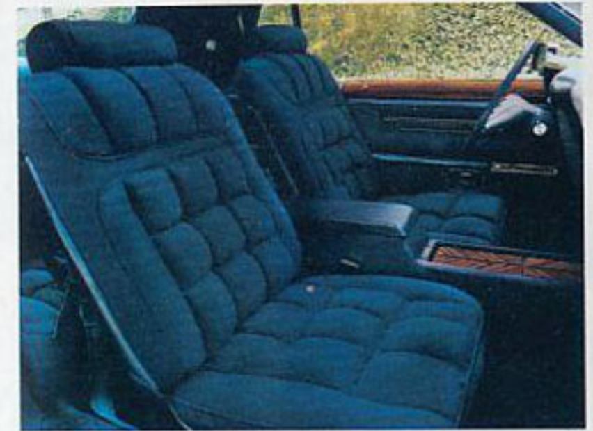
Mark V Collector's Series interior

Here is the highest expression of luxury among cars that trace their lineage to the original Lincoln Continental. The Collector's Series interior in Midnight Blue Kasman II luxury cloth features six-way power bucket seats with passenger recliner.