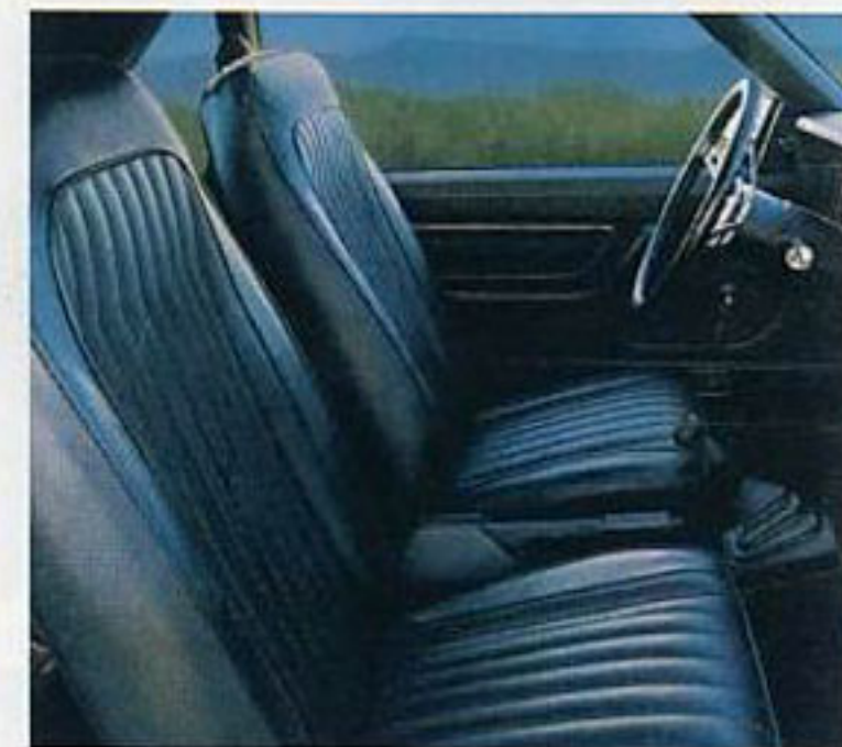
Capri standard high-back bucket seat interior

Created new to add to the pure joy of driving.