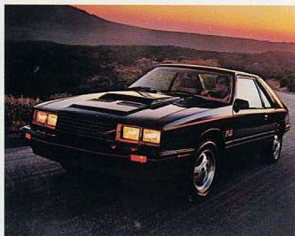
1979 Mercury Capri Turbo RS

There's more than one way to get a Capri thrill in '79. There's Mercury Capri, shown at the top. For more flair, the sexier, "flashier" Capri RS, far left. And, left, Capri Turbo RS, with a turbocharged 2.3 litre engine, TRX wheels and Michelin tires standard. And Capri is comfortable to live with, as evidenced by the base Capri interior shown above. Choose bucket seats in pleated Corinthian vinyl or rich looking optional Danbury cloth.