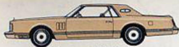
Continental Mark V