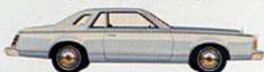
Cougar 2-dr. hardtop w/Brougham Option