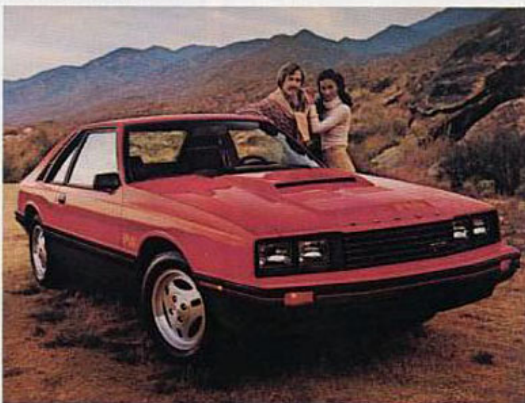
1979 Mercury Capri RS