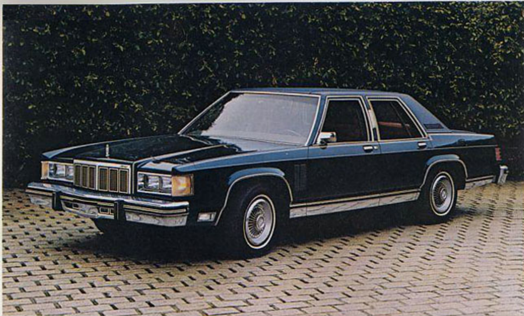
1979 Mercury Grand Marquis 4-door sedan