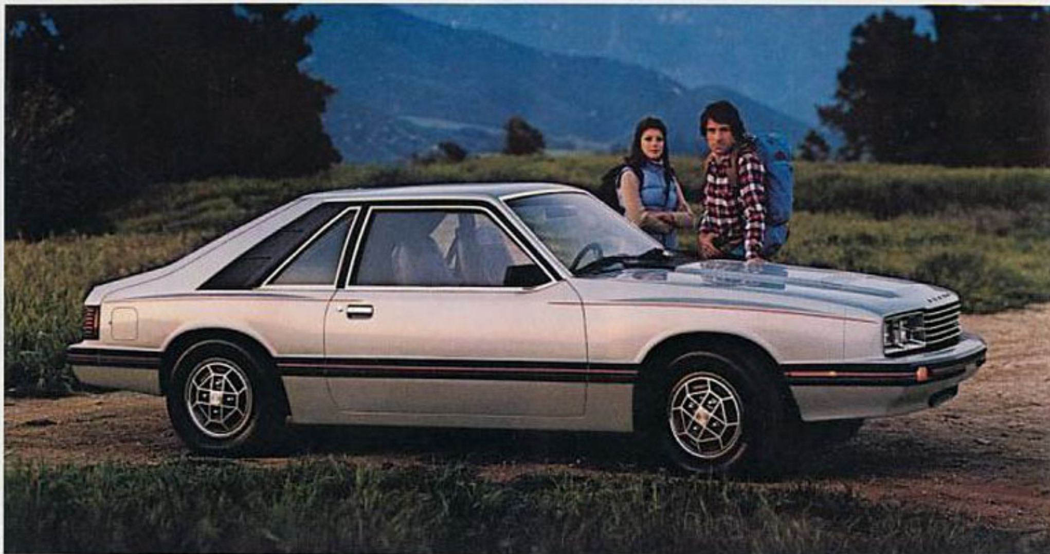
1979 Mercury Capri