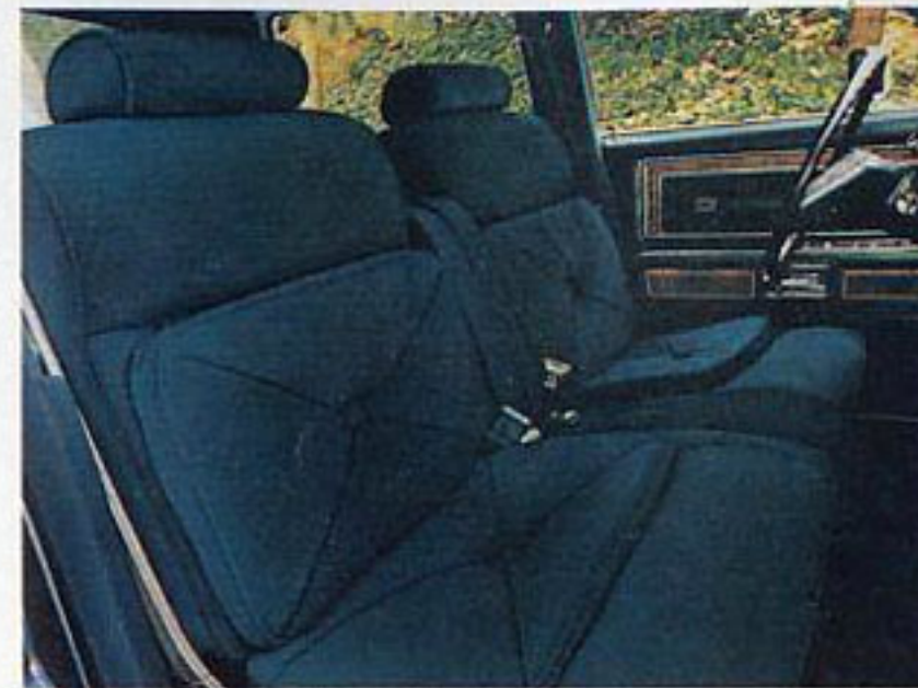
Continental Collector's Series Interior

This Lincoln Continental Town Car's beauty is enhanced by a distinctive gold color grille and special Midnight Blue Metallic finish. The interior reflects Continental's reputation for roominess and elegance.