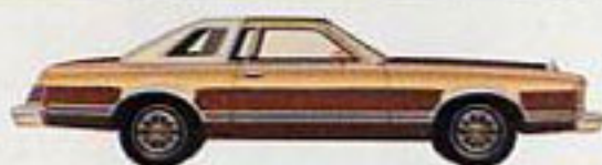
Cougar XR-7 2-dr. hardtop with Decor Option