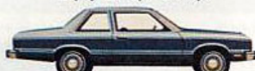
Zephyr 2-dr. sedan w/Ghia Option