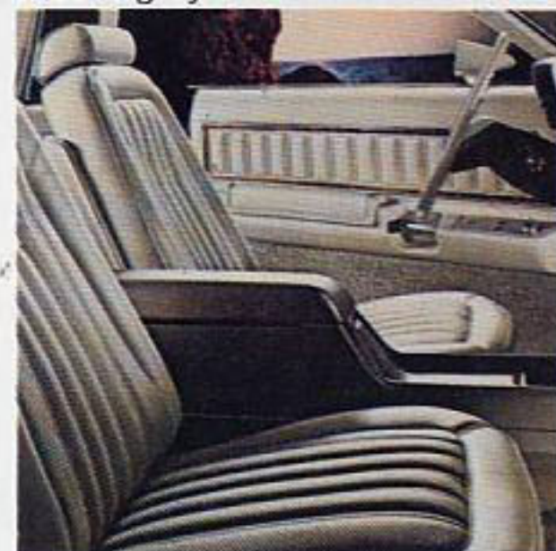
Optional Cougar Bucket Seat interior

Shown below: the optional Cougar bucket seat interior in dove grey.