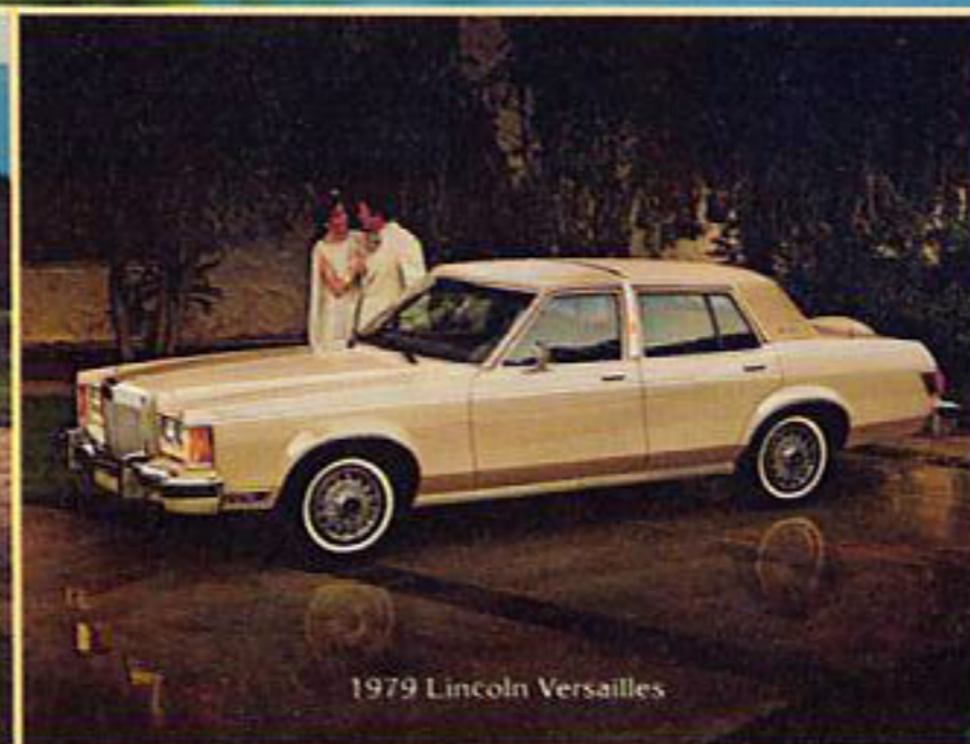
1979 Lincoln Versailles