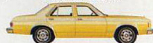
Monarch 4-dr. sedan