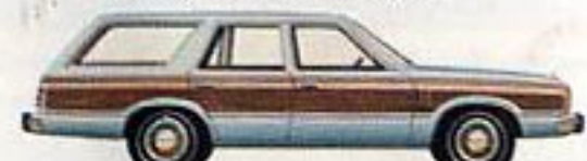
Zephyr Wagon w/Villager Option