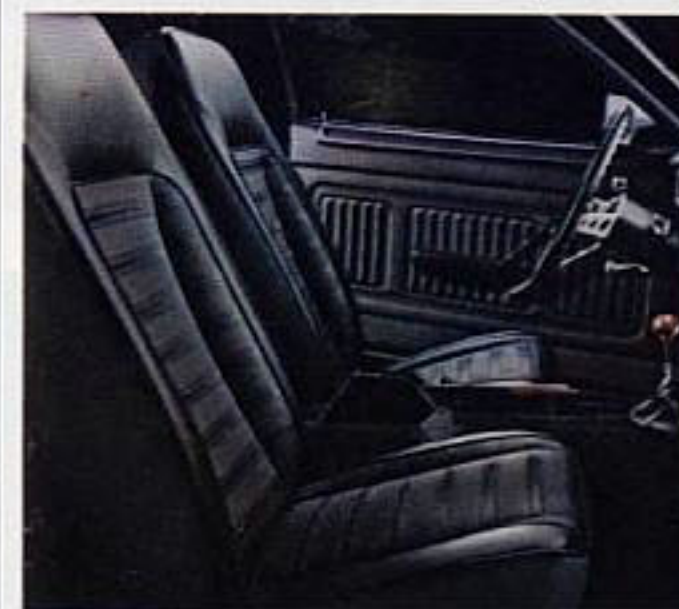
Mercury Bobcat standard bucket seats