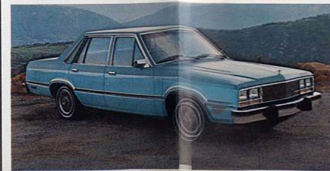
1979 Mercury Zephyr 4-door sedan w/Ghia Option