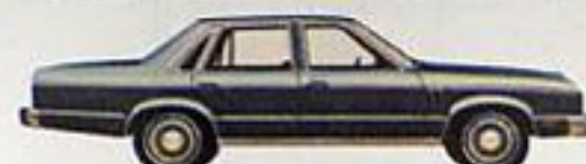
Zephyr 4-dr. sedan