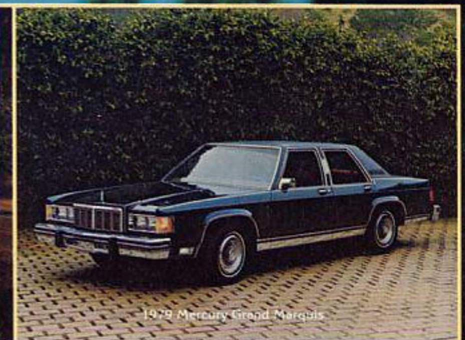
1979 Mercury Grand Marquis