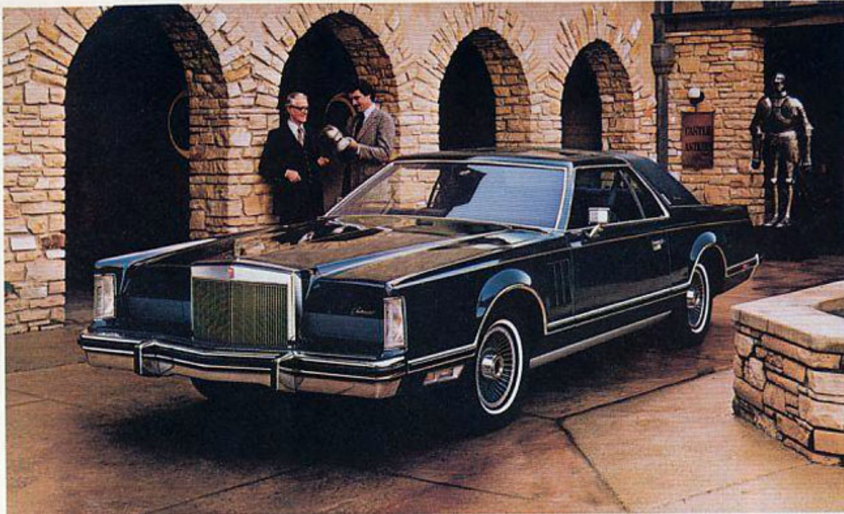
Collector's Series Continental Mark V in Midnight Blue Metallic

Some items shown are optional. See dealer for a complete list of standard and optional equipment.