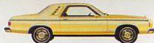
Monarch 2-dr. sedan with ESS option