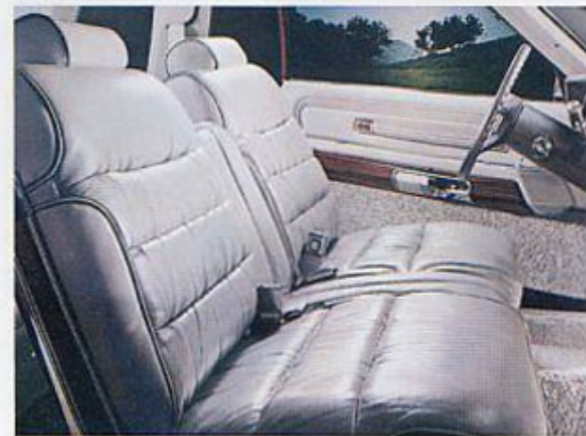
Mercury Grand Marquis Twin Comfort Lounge seat interior

Upper left, the Grand Marquis 4-door sedan. Lower left, the Marquis Brougham 2-door sedan.