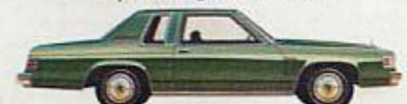
Marquis 2-dr. sedan