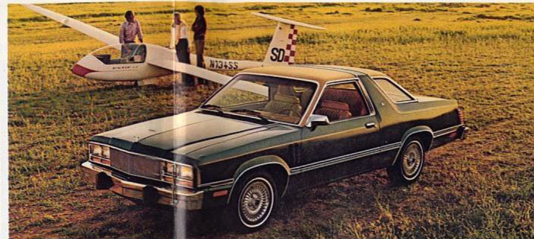
1979 Mercury Zephyr Z-7