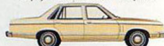
Zephyr 4-dr. sedan w/Ghia Option