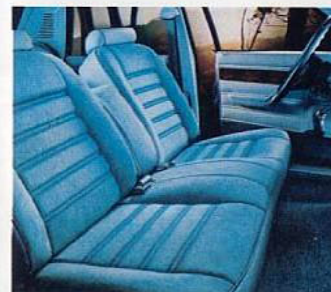
Mercury Zephyr with Ghia Option interior