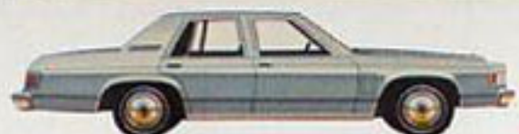
Marquis 4-dr. sedan