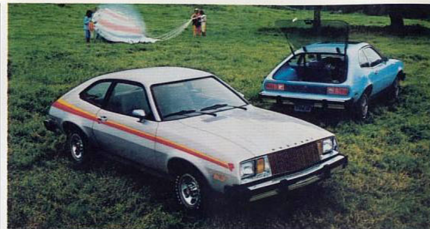
1979 Mercury Bobcat 3-dr. Runabout w/Sports Package Option and Sports Accent Option

Above: Zephyr's Ghia Option interior features Flight Bench seat, woodtone insert door trim, luxury steering wheel and woodtone applique instrument panel.