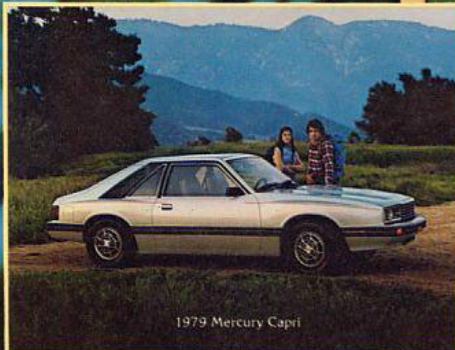
1979 Mercury Capri