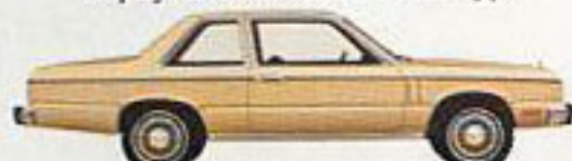
Zephyr 2-dr. sedan