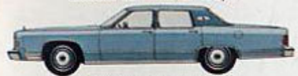
Lincoln Continental sedan