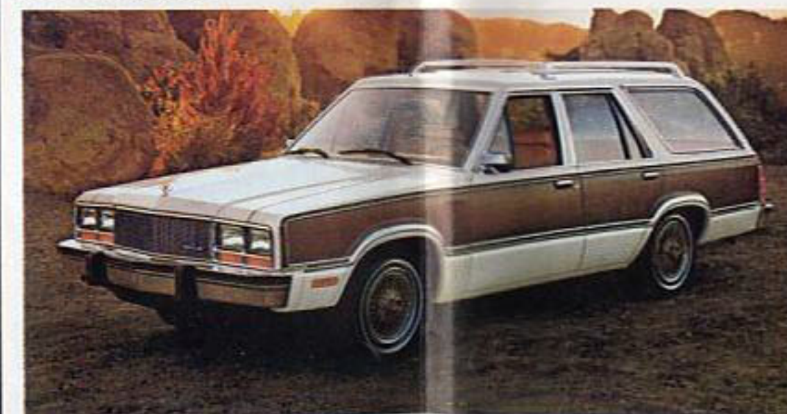
1979 Mercury Zephyr Wagon w/Villager Option