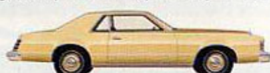
Cougar 2-dr. hardtop