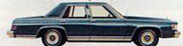
Grand Marquis 4-dr. sedan