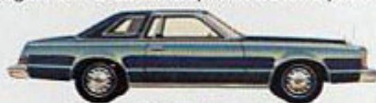
Cougar XR-7 2-dr. hardtop