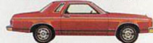
Monarch 2-dr. sedan