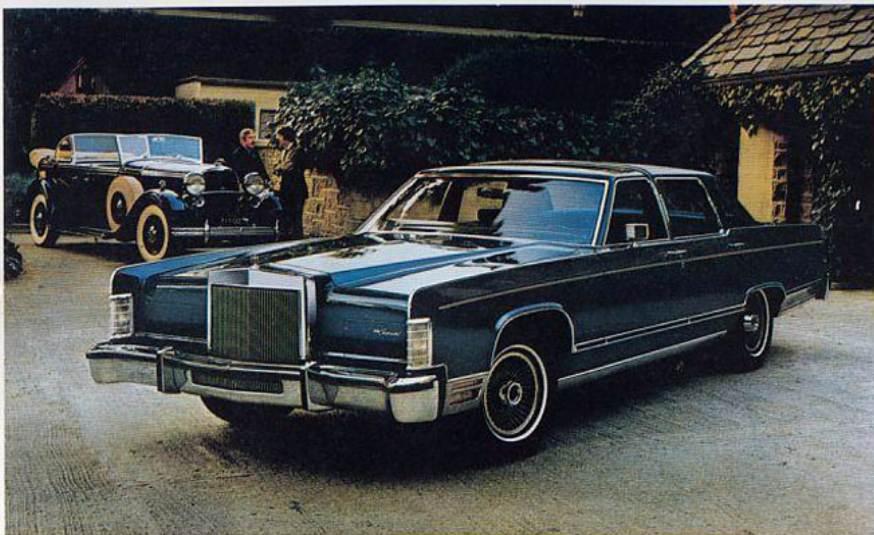
Collector's Series Lincoln Continental