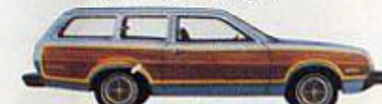
Bobcat Villager Station Wagon