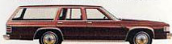
Marquis Station Wagon