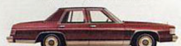
Marquis Brougham 4-dr. sedan