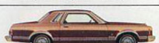
Monarch 2-dr. sedan with Ghia Option