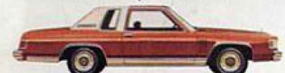
Marquis Brougham 2-dr. sedan