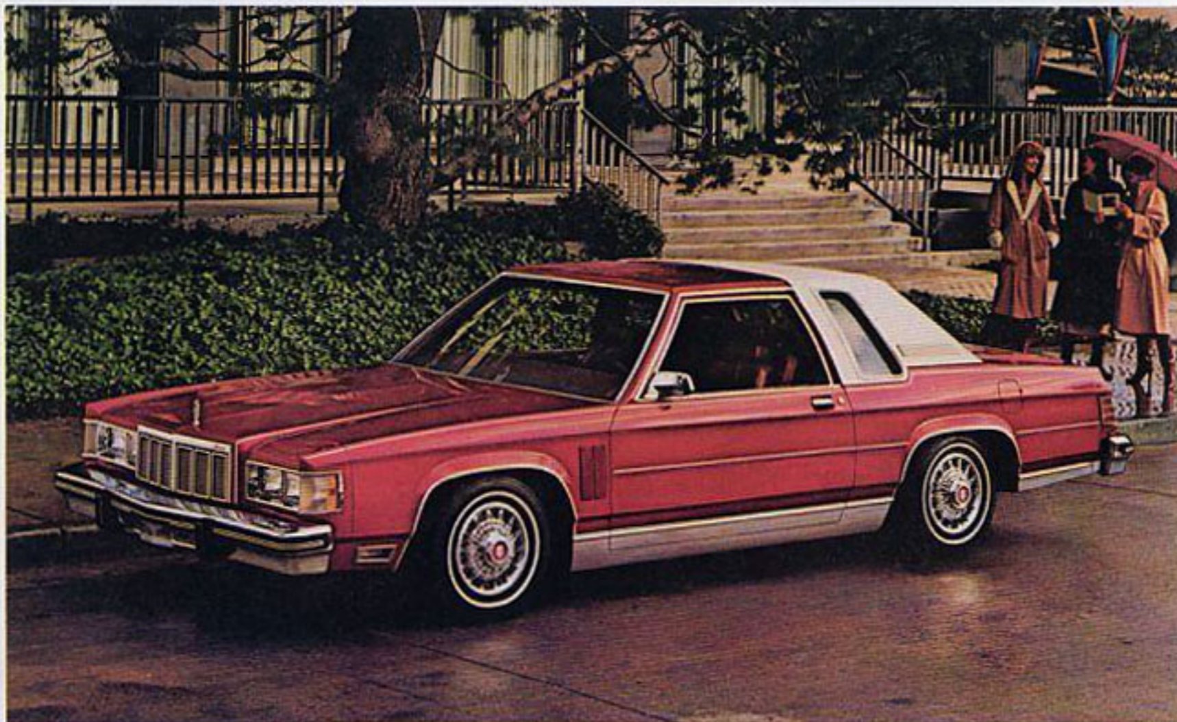
1979 Mercury Marquis Brougham 2-door sedan