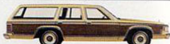
Marquis Wagon w/Colony Park Option