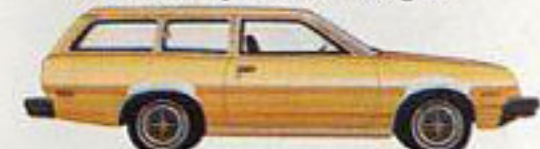
Bobcat Station Wagon