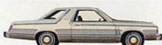
Zephyr Z-7 Sports Coupe