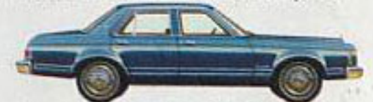
Monarch 4-dr. sedan with Ghia Option