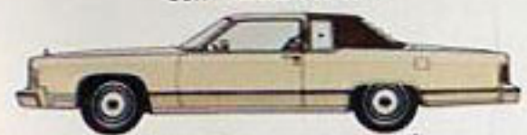
Lincoln Continental Coupé