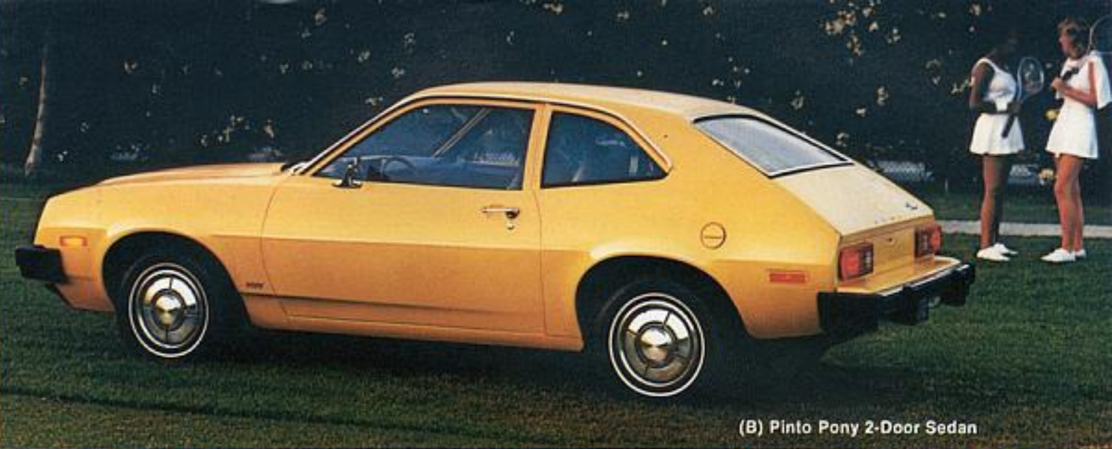
(B) Pinto Pony 2-Door Sedan

The second was a Truck Passing Test. Each car accelerated starting at 20 mph as it passed a truck and returned to its original traffic lane. Pinto won once again. The '79 Pinto, with a more stylish new look and the makings of a winner, invites the competition to a rematch at Indy. Show you've got the makings of a winner