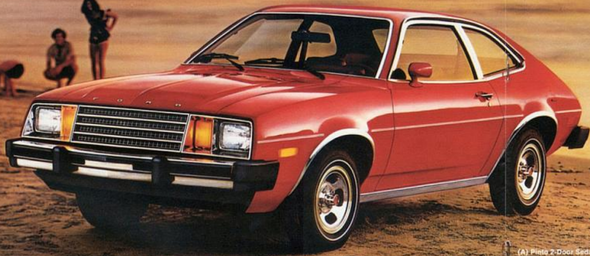
(A) Pinto 2-Door Sedan with Exterior Decor Group