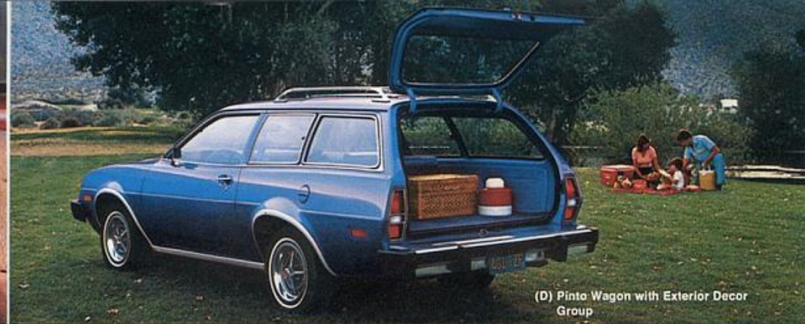
(D) Pinto Wagon with Exterior Decor Group