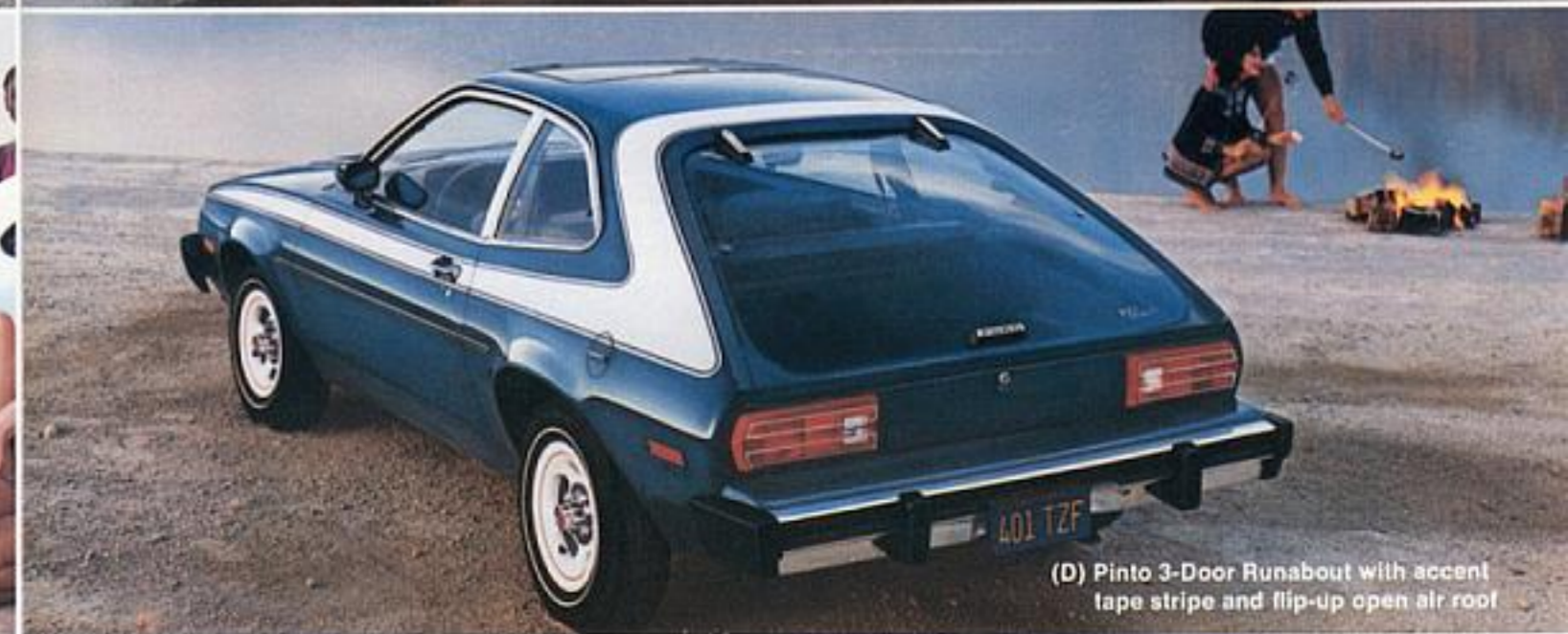
(D) Pinto 3-Door Runabout with accent tape stripe and flip-up open air roof