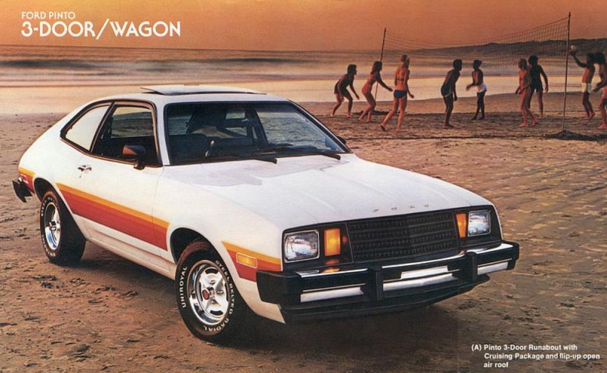
(A) Pinto 3-Door Runabout with Cruising Package and flip-up open air roof