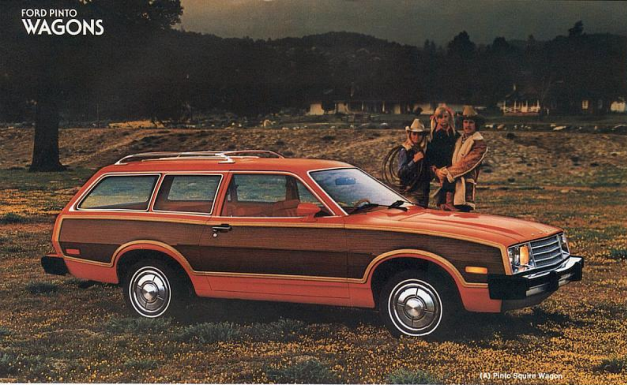
(A) Pinto Squire Wagon