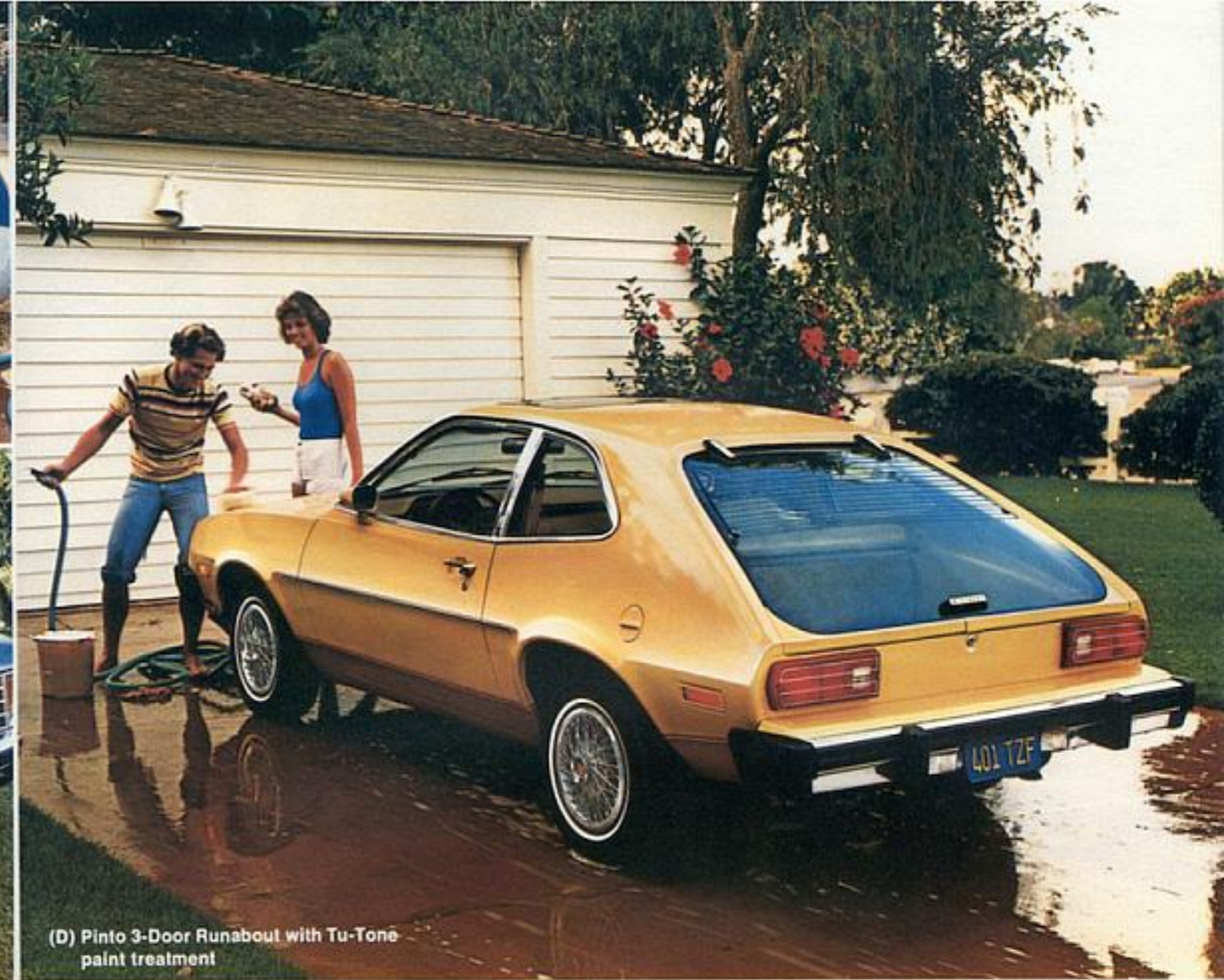
(D) Pinto 3-Door Runabout with Tu-Tone paint treatment