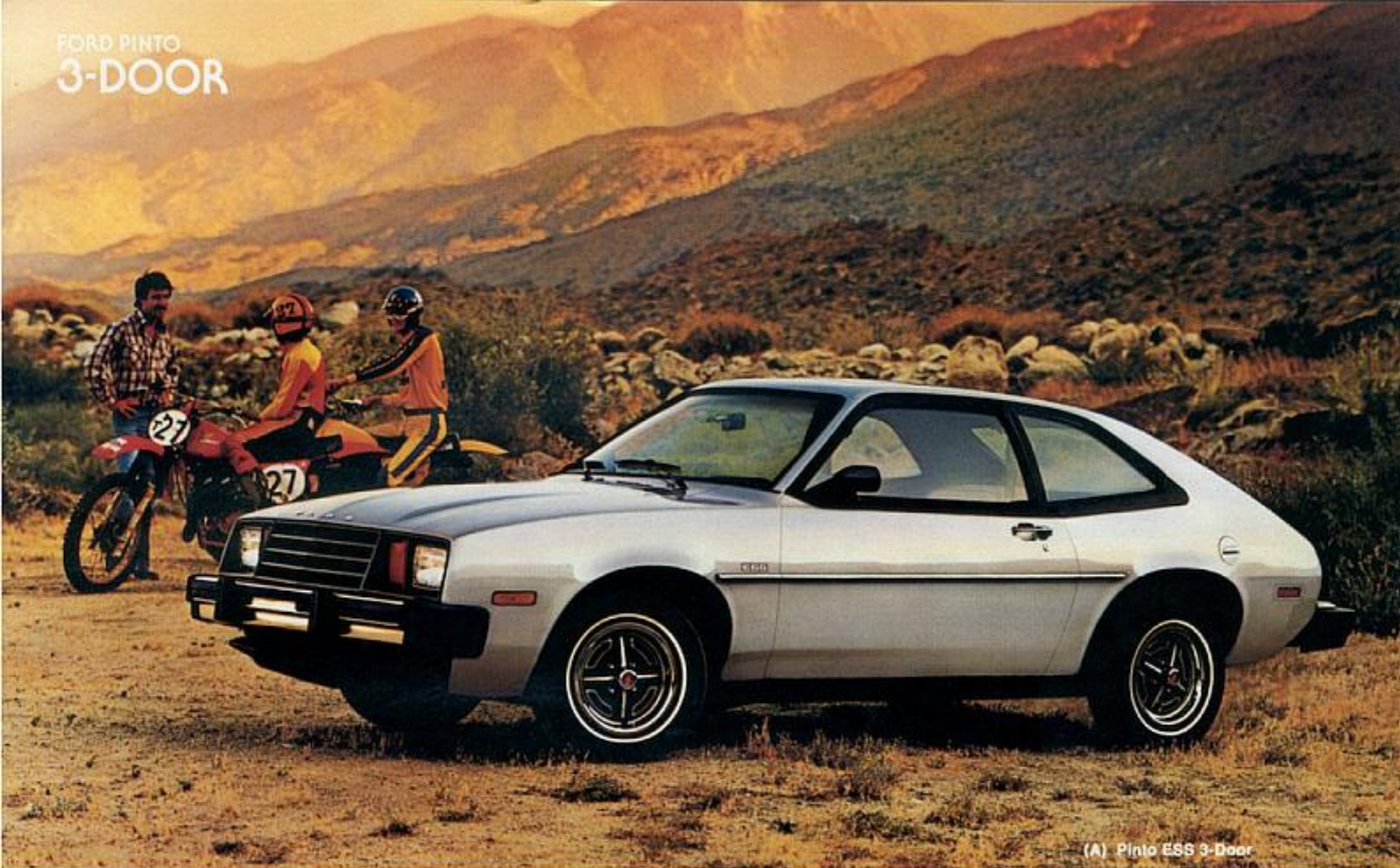
(A) Pinto ESS 3-Door