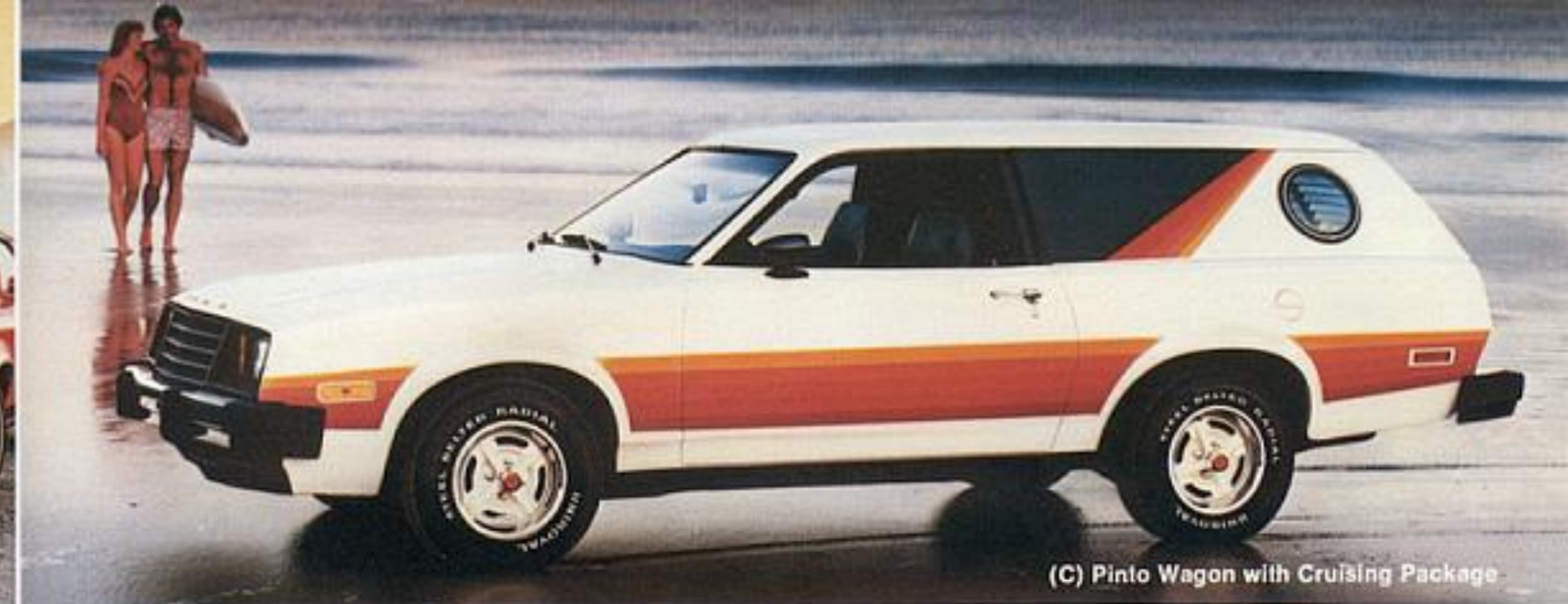
(C) Pinto Wagon with Cruising Package