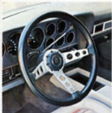
8. Tilt steering wheel