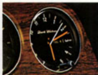
6. Day/date electric clock