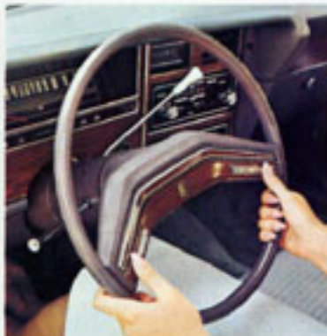
10. Fingertip speed control