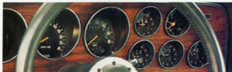
7. Sports instrument panel