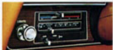
4. SelectAire conditioner