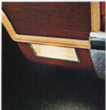
9. Front cornering lamps