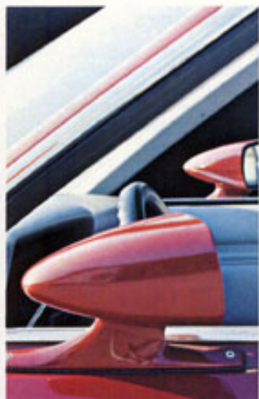
1. Dual sport mirrors