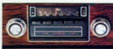
5. AM/FM stereo with search feature