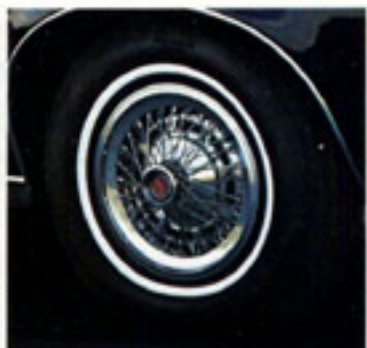
2. Wire wheel covers