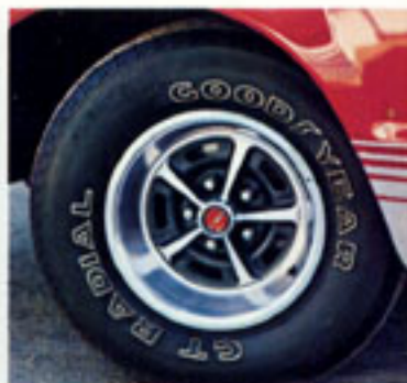
3. Mag 500 chrome wheels