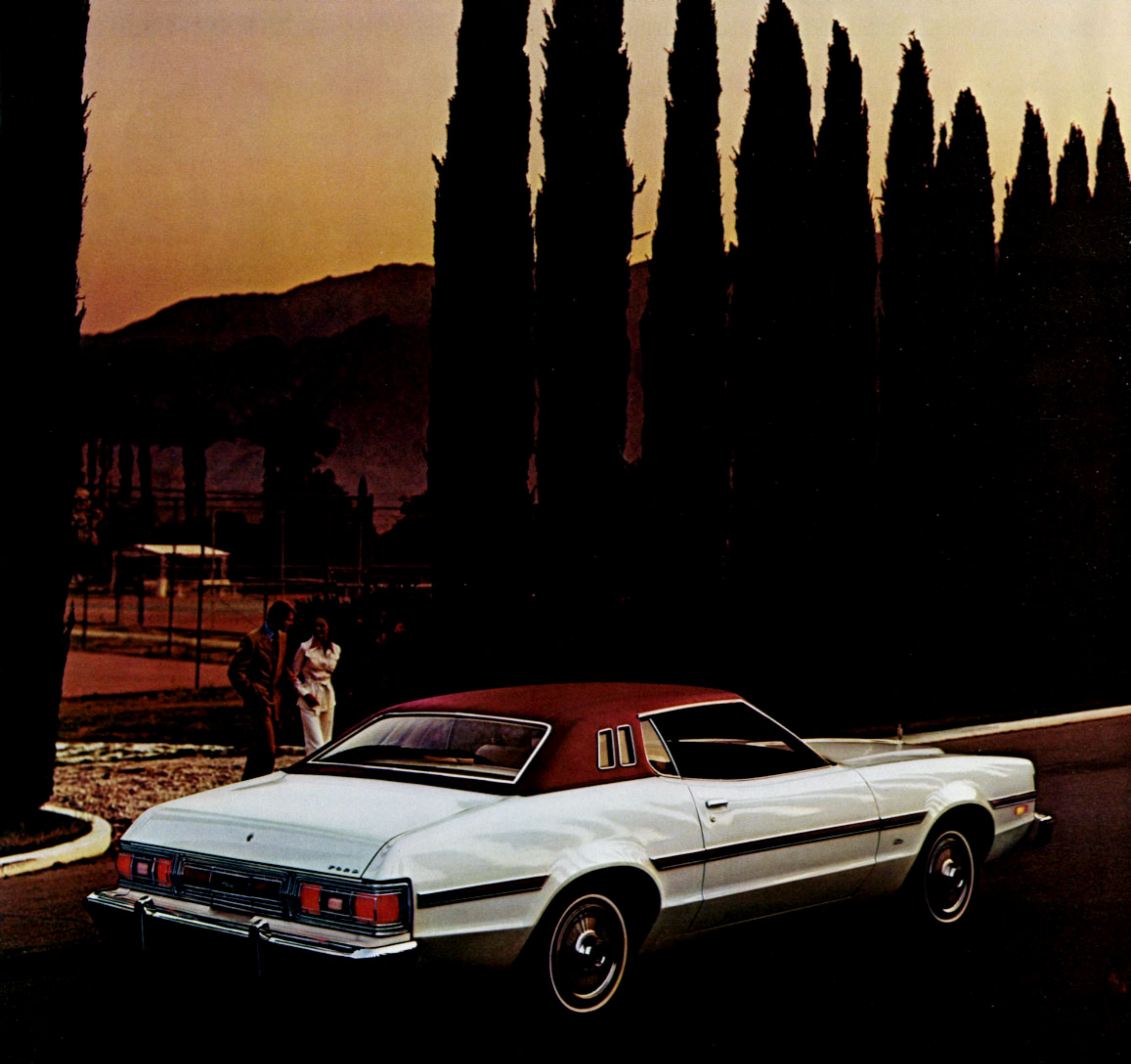
Elite in Polar White (Code 9D) with Red Full Vinyl Roof.