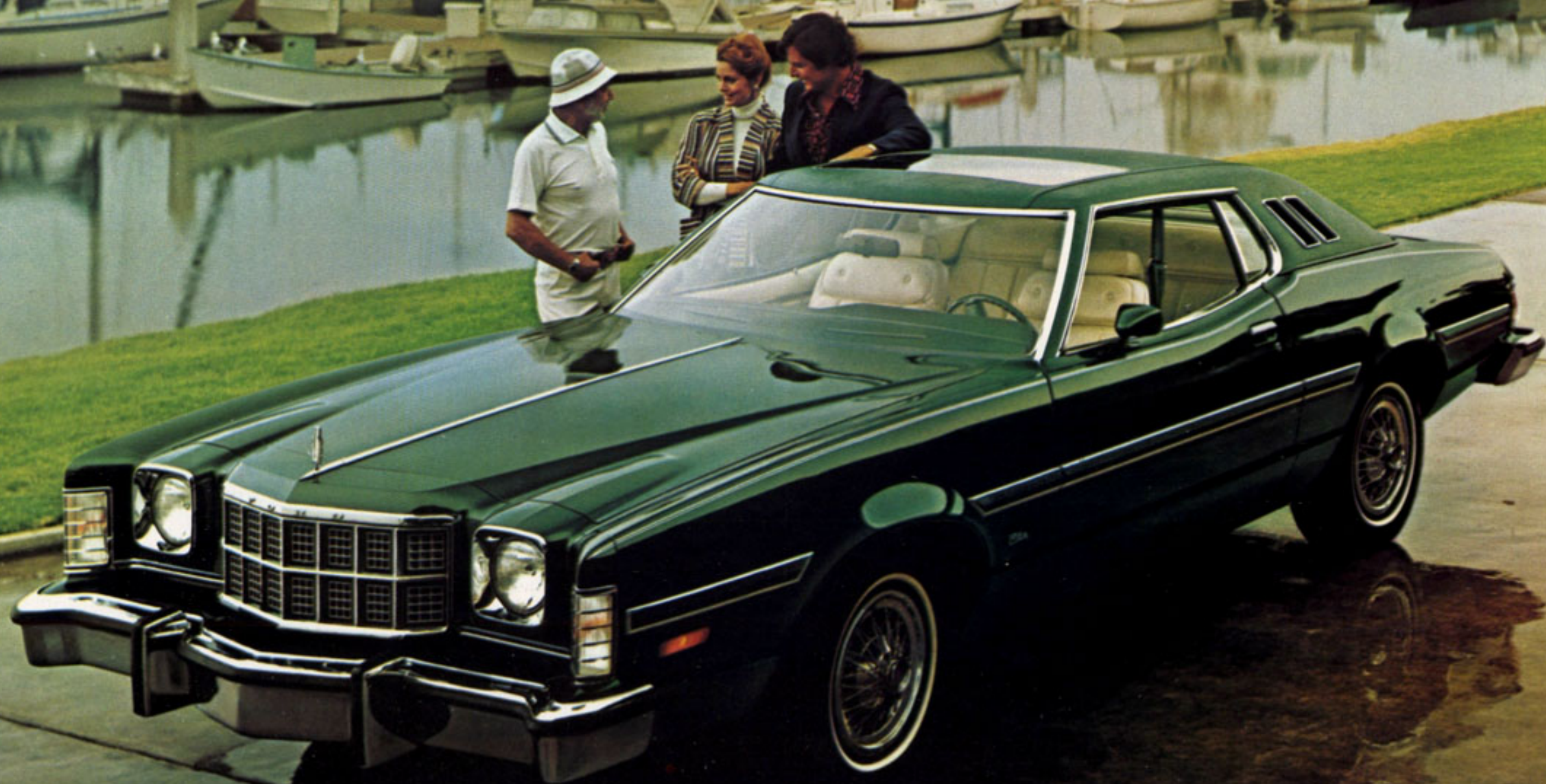
Elite in Dark Jade Metallic (Code 46) with Jade Full Vinyl Roof

Notes: See "Notable Standard Features" list on back cover. Other items shown are optional. Also see back cover for options in detail, measurements and color code reference.