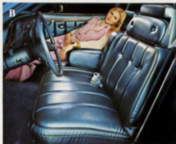
(A) Standard Elite Instrument Panel is highlighted with rich-looking woodtone vinyl appliques. Controls and instruments are all within easy reach and conveniently lighted. (B) Comfortable Reclining Passenger Seat is available with Interior Decor Group. Seat back adjusts manually to a number of reclining positions. Shown in Blue vinyl (Code DB).

optimum performance and resistance to damage • Interior components styled and color-keyed to suit your Elite