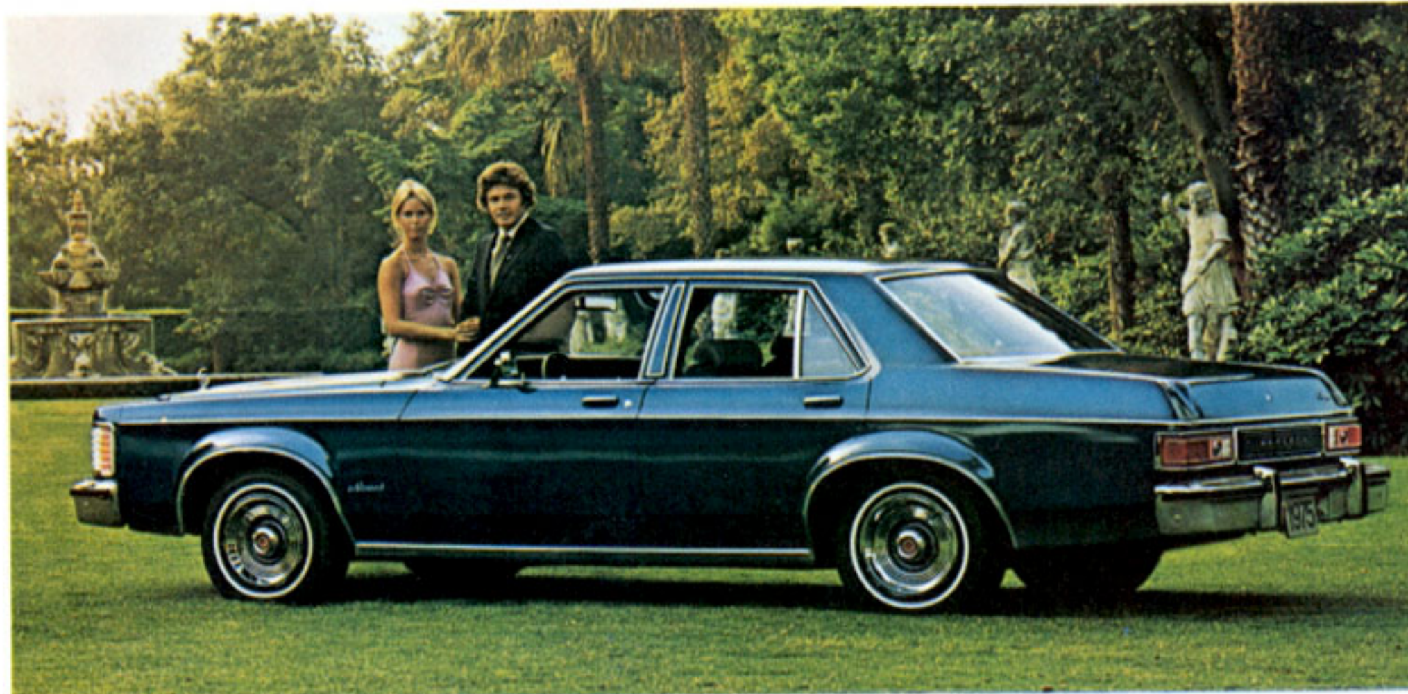
MERCURY MONARCH 4-DOOR SEDAN, shown with optional WSW tires and bumper protection group.