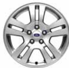
17" Painted Aluminum Standard on SE