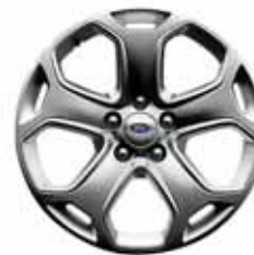
18" Painted Aluminum Standard on SEL