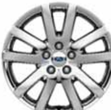
18" Chrome-Clad Aluminum Available on SEL