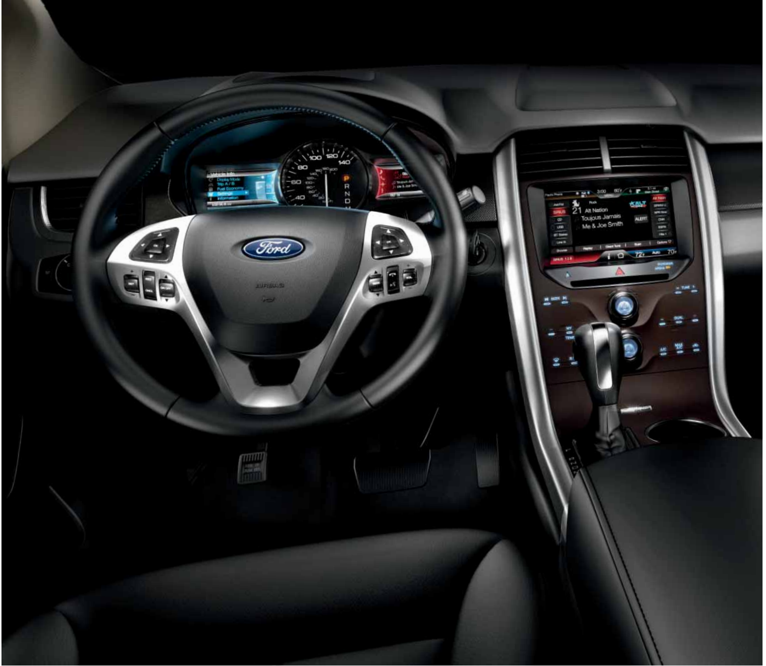
SEL. Charcoal Black leather trim. Available equipment. | 2.0L EcoBoost® I-4 engine! | MyFord® 4.2" color LCD display. | SEL. Charcoal Black cloth trim. | 12-volt powerpoint, one of 4 in Edge.