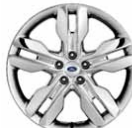
20" Chrome-Clad Aluminum Available on SEL