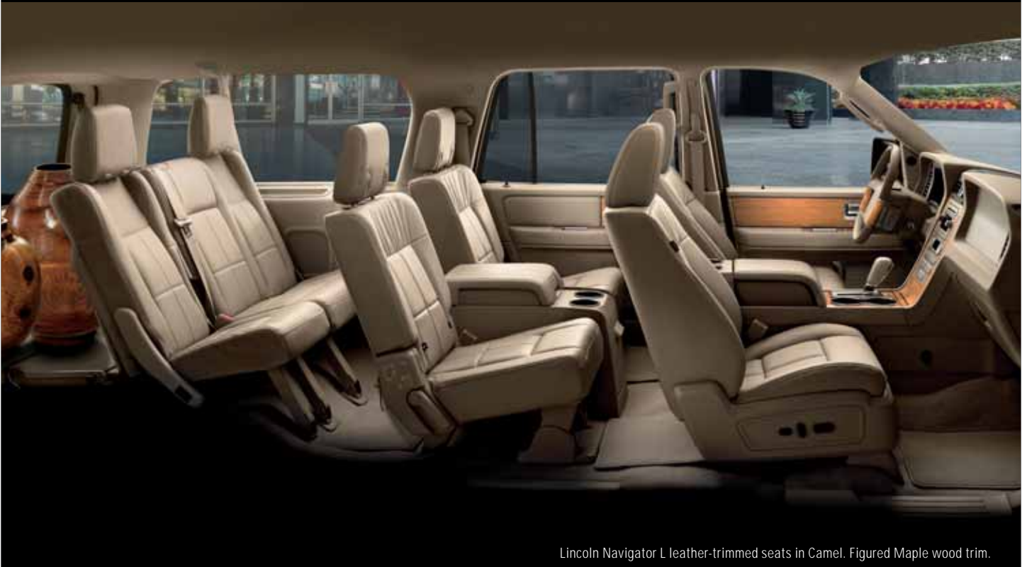
Lincoln Navigator L leather-trimmed seats in Camel. Figured Maple wood trim.