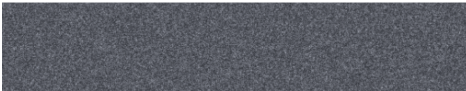
STERLING GREY METALLIC