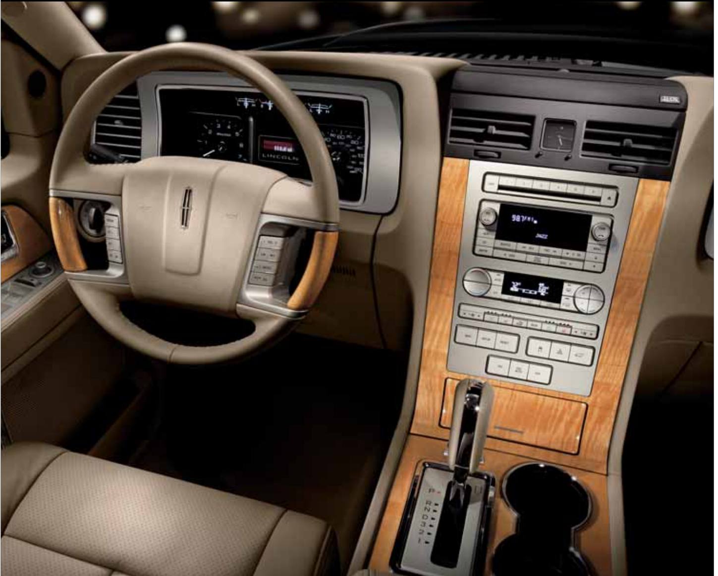
Lincoln Navigator leather-trimmed seats in Camel, Figured Maple wood trim. Shown with available equipment.