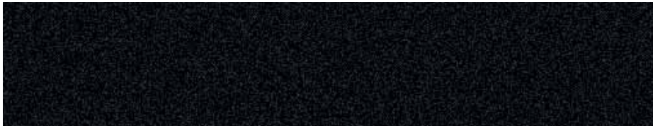
TUXEDO BLACK METALLIC