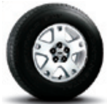
16" Bright Machined Aluminum Wheel