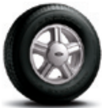
15" Aluminum Wheel