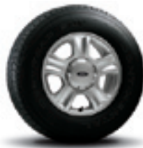
16" Aluminum Wheel