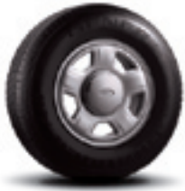
15" Styled Steel Wheel