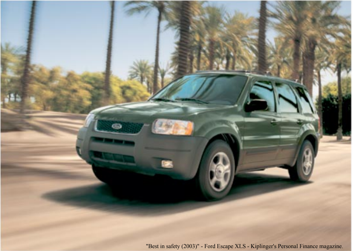
"Best in safety (2003)" - Ford Escape XLS - Kiplinger's Personal Finance magazine.