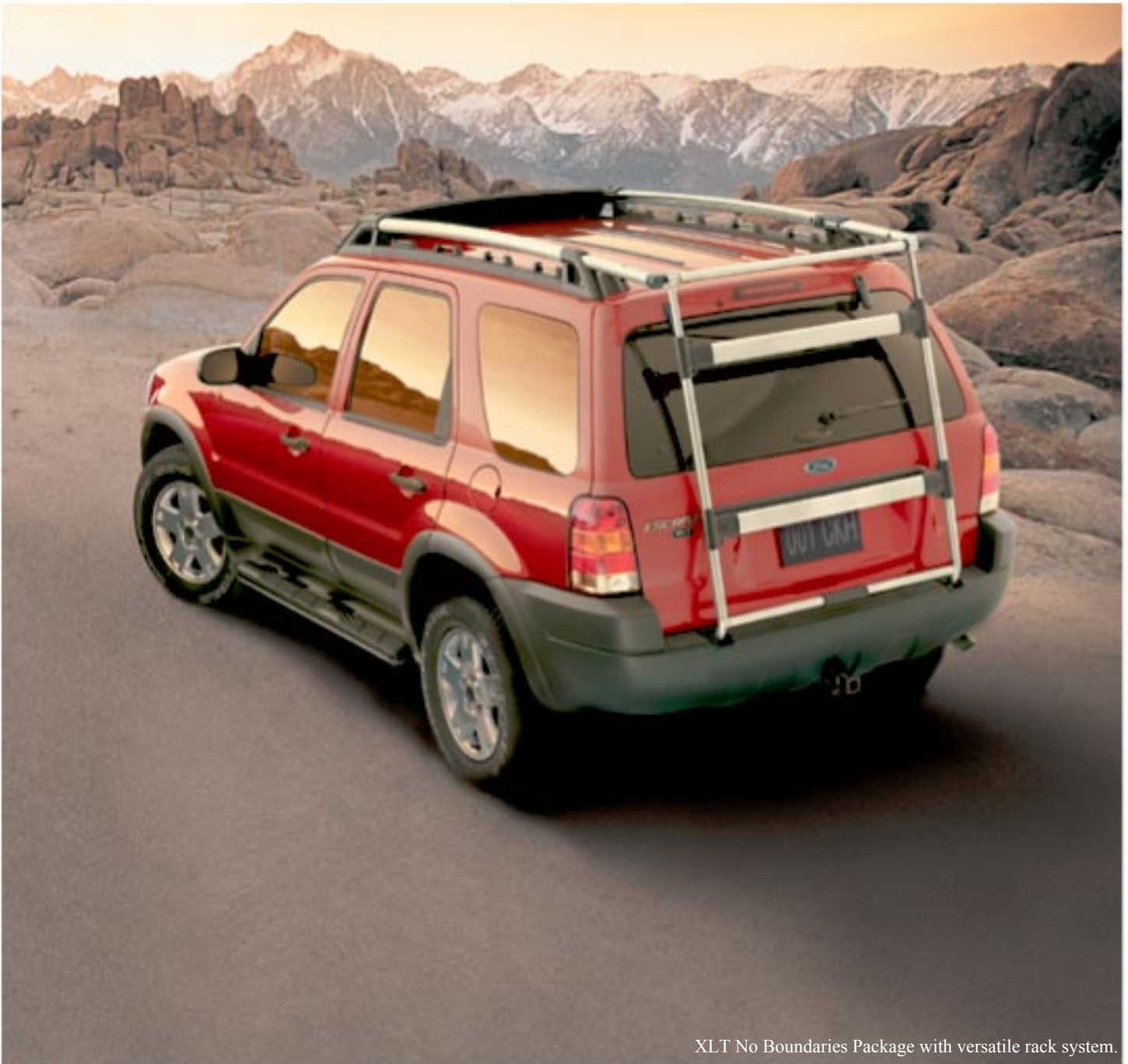
XLT No Boundaries Package with versatile rack system.