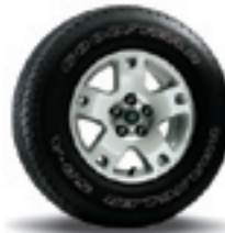
16" Painted Aluminum Wheel