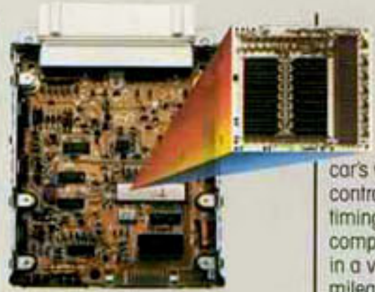
speed manual overdrive transmission. Its brain is the Electronic Engine Control (EEC-IV), shown

Capri Turbo RS runs on some of the most sophisticated automotive hardware available today. Its heart is a 2.3 liter engine, turbocharged, electronically fuel-injected and teamed with a five-