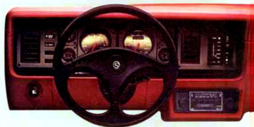
RS interior in Light Canyon Red. Options shown are listed on page 12.

**Requires tinted glass and passenger-side remote-control mirror.