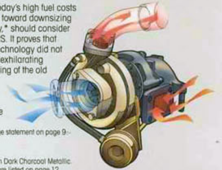
Capri Turbo RS in Dark Charcoal Metallic. Options shown are listed on page 12.