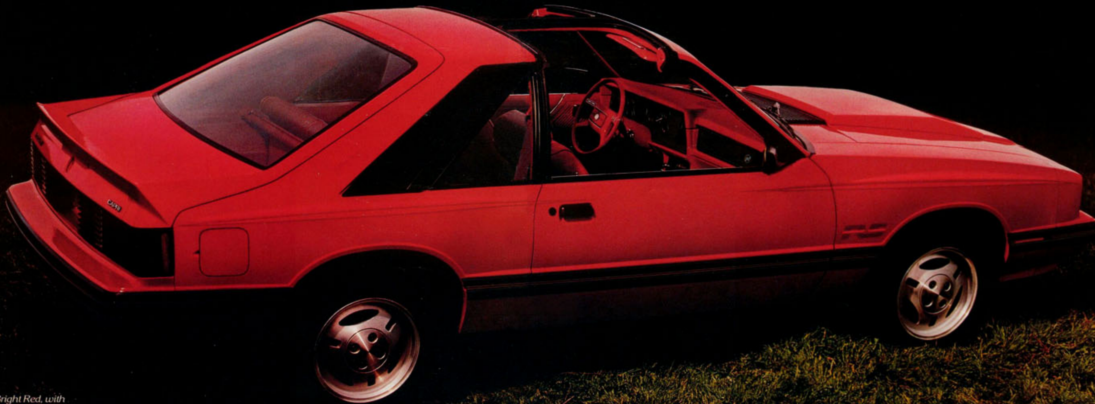
Mercury Capri RS in Bright Red, with optional Michelin TRX tires, forged metric aluminum wheels and T-roof.

Some of the equipment shown may be available only at extra cost, and only on specific models. Please see pages 8 through 11 for specific information regarding standard and optional equipment.