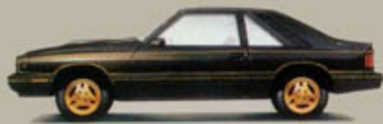
CAPRI BLACK MAGIC

Includes all Capri standard features, plus these additions and/or differences: