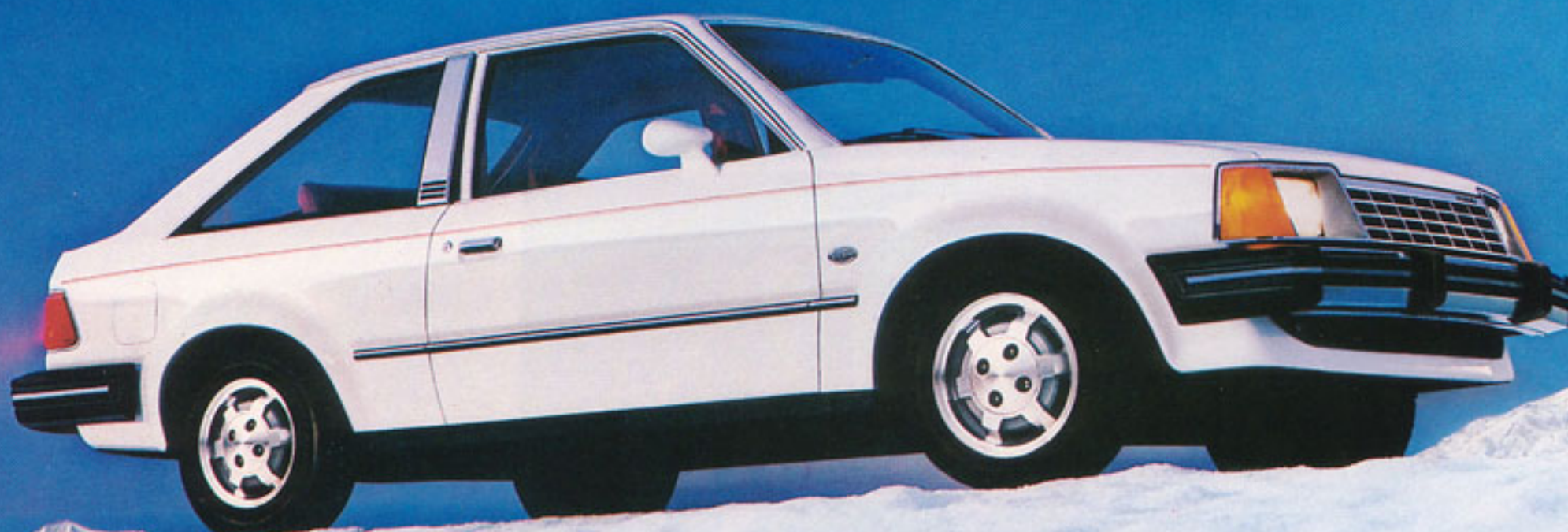
Escort GLX 3-Door Hatchback in Polar White (9D)