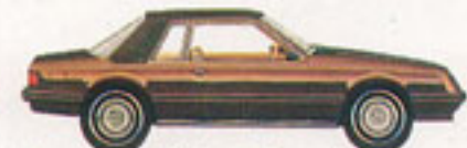
Mustang Ghia 2-Door Dark Brown Metallic (5Q)