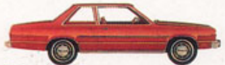
Fairmont 2-Door Bittersweet Glow (8D)