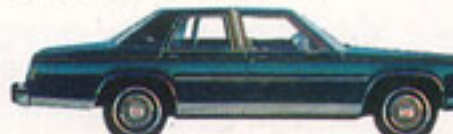
LTD Crown Victoria 4-Door Midnight Blue Metallic (3L)

*Option group. See individual 1981 car catalogs for complete details.