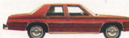
LTD 4-Door Dark Cordovan Metallic (8N)