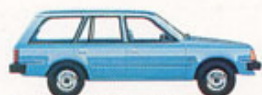
Escort 4-Door Liftgate Bright Blue Metallic (3M)

In 1981, we want to put you in a car we can both be proud of.