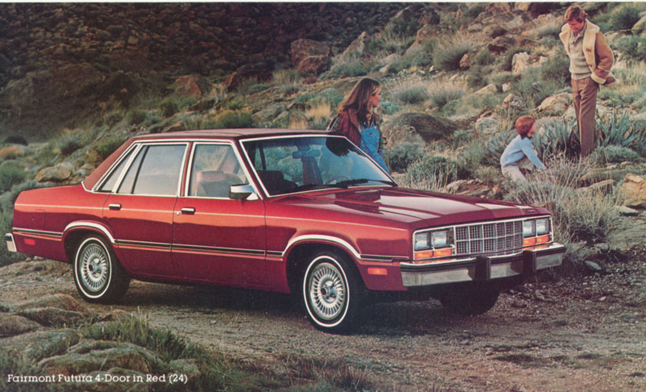
Fairmont Futura 4-Door in Red (24)