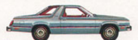
Futura 2-Door Silver Metallic (1G)