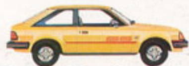
Escort SS 3-Door Hatchback Bright Yellow (6N)