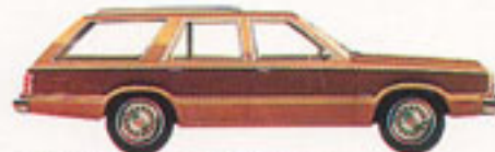
Futura Squire Wagon* Sand Glow (6B)