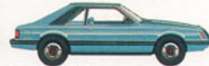
Mustang 3-Door Medium Blue Glow (3H)