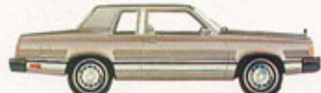
Granada L 2-Door Medium Fawn Glow (55)