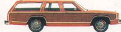
LTD Country Squire Wagon Bittersweet Glow (8D)