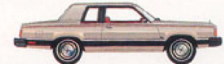
Granada GLX 2-Door Light Pewter Metallic (1T)