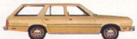
Fairmont Wagon Pastel Chamois (86)