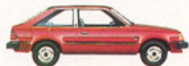
Escort L 3-Door Hatchback Red Glow (2H)