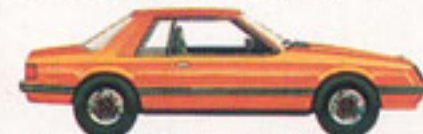
Mustang 2-Door with Sport Option* Bittersweet Glow (8D)