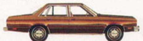
Fairmont 4-Door Dark Brown Metallic (5Q)