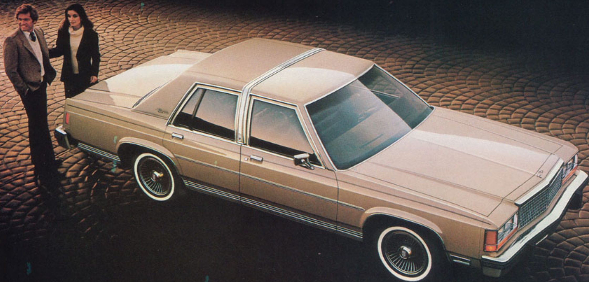
LTD Crown Victoria in Fawn (89) with matching padded rear half vinyl roof