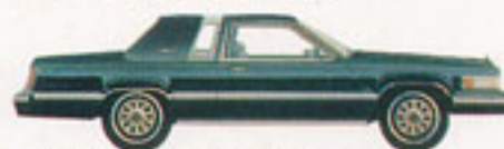
Thunderbird Heritage Black (1C)