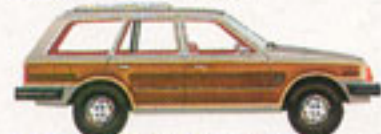
Escort GLX 4-Dr. Liftgate Squire Wagon Opt.* Silver Met. (1G)