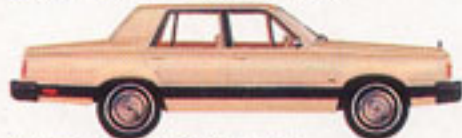
Granada GLX 4-Door Pastel Chamois (86)