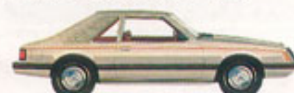
Mustang Ghia 3-Door Light Pewter Metallic (1T)