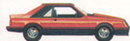
Mustang Cobra 3-Door* Bright Red (27)