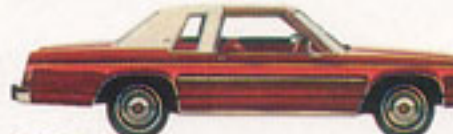
LTD 2-Door Red (24)