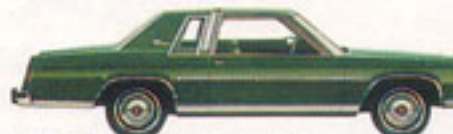
LTD Crown Victoria 2-Door Dark Pine Metallic (7M)