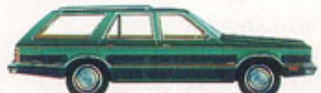
Fairmont Futura Wagon Medium Dark Spruce Metallic (4J)