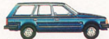
Escort GL 4-Door Liftgate Dark Blue Metallic (3D)