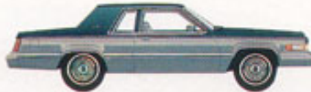
Thunderbird Tu-Tone Midnight Blue Met. (3L)/Med. Blue Glow (3H)