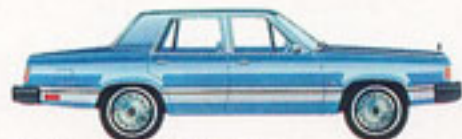
Granada GL 4-Door Medium Blue Glow (3H)