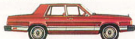
Granada L 4-Door Red (24)