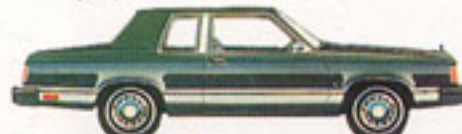
Granada GL 2-Door Medium Dark Spruce Metallic (4J)