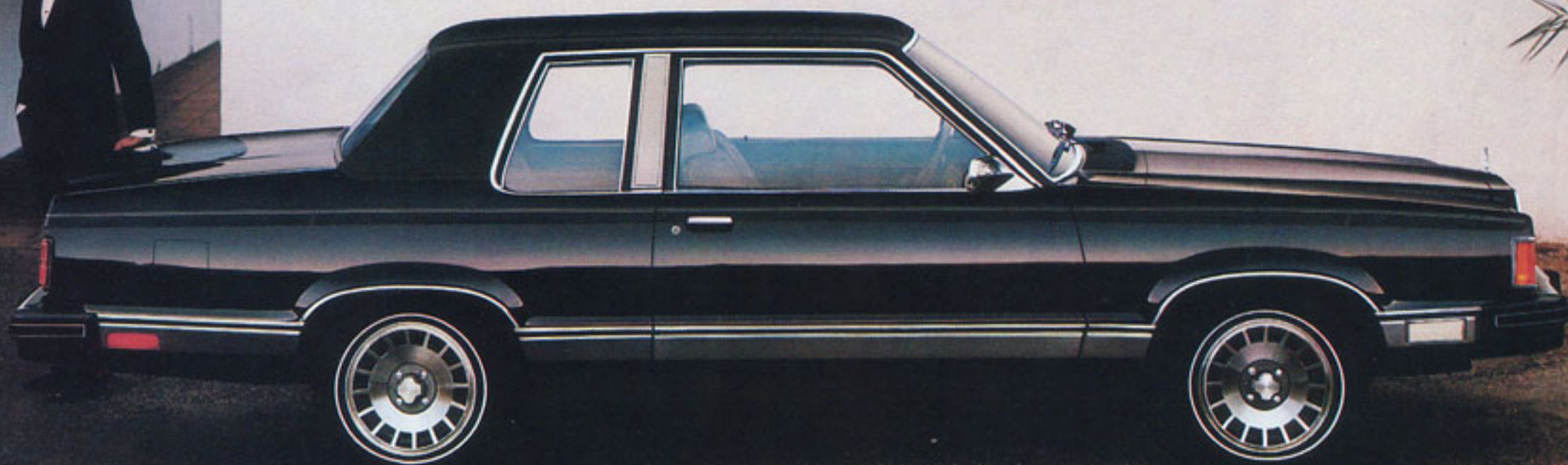
Granada GL 2-Door in Black (1C)