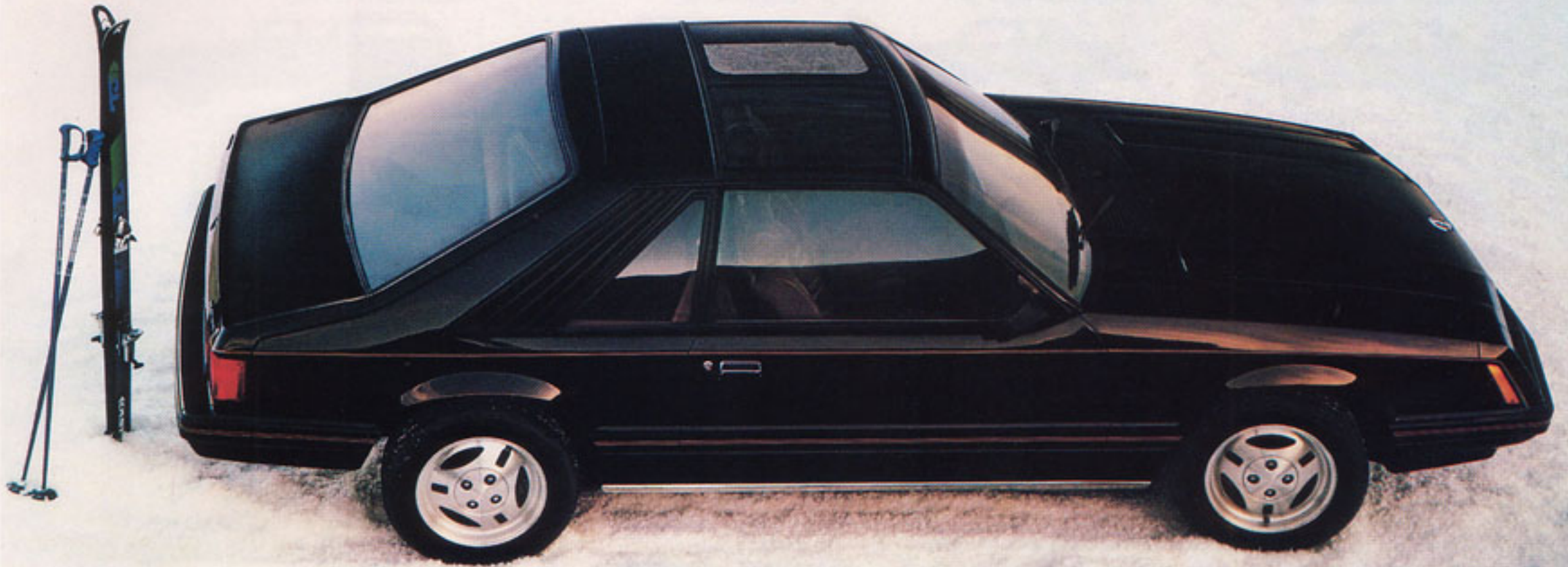
Mustang Ghia in Black (1C) with new T-Roof option.