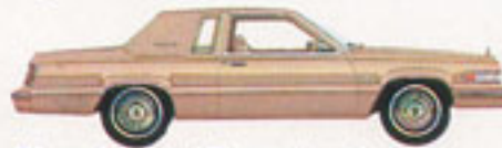
Thunderbird Town Landau Light Fawn Glow (5H)