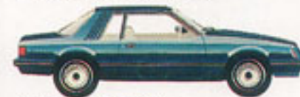
Mustang 2-Door Midnight Blue Metallic (3L)