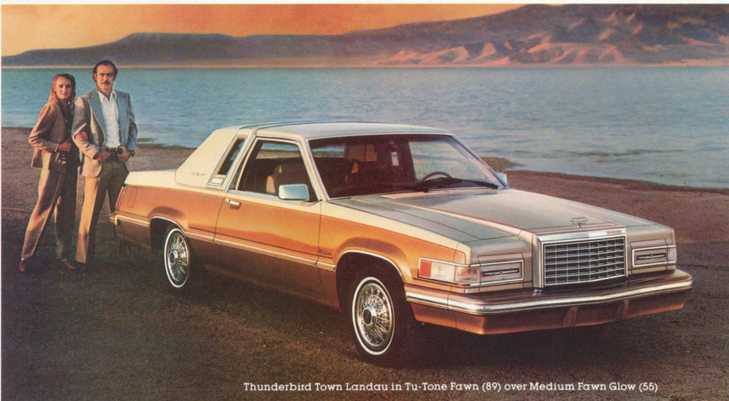
Thunderbird Town Landau in Tu-Tone Fawn (89) over Medium Fawn Glow (55)