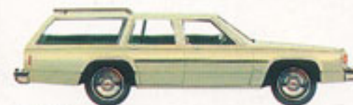
LTD Wagon Light Pine Glow (4E)