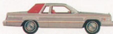
Thunderbird—Ext. Decor Group* Light Grey (12)