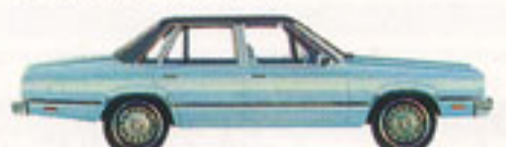
Futura 4-Door Light Medium Blue (3F)