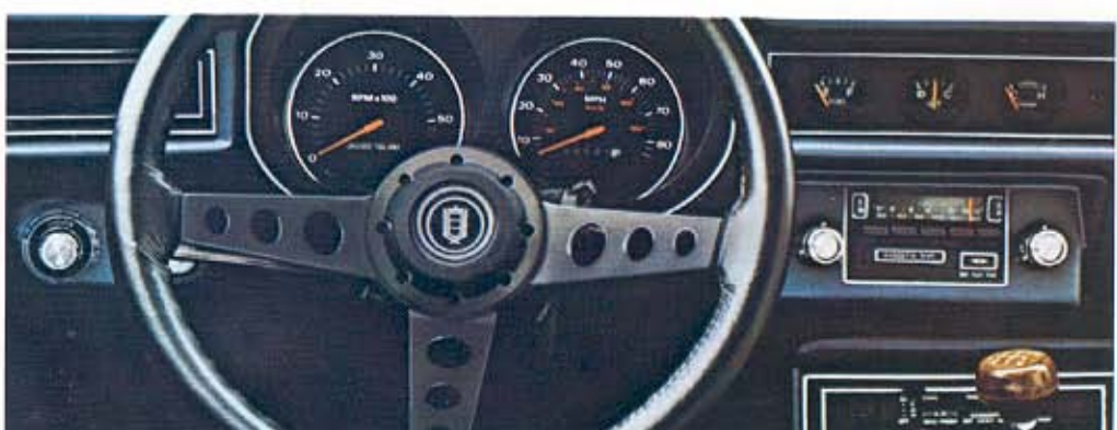
Optional Sports Instrumentation Group, including tach, gauges and sports steering wheel