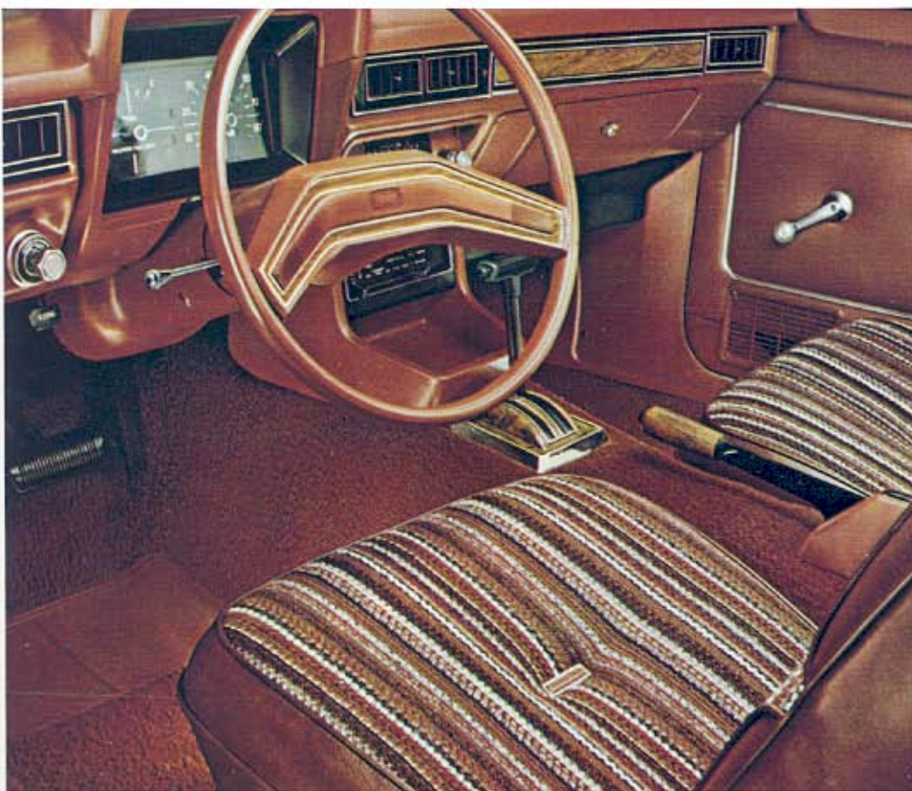
Optional deluxe interior trim with Vaquero Scanda cloth seat trim option

NOTE: Some items are optional. See notable standard features, measurements and color code reference listed throughout this catalog.