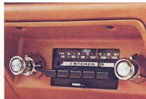
Optional AM/FM Stereo radio

on this page are just some of the ways you can tailor Bobcat to suit your taste. Standard steel-belted radials can be dressed with optional white sidewalls, as shown in the upper right corner. Then couple them with any of six wheel designs. An AM/FM Stereo is just one of four radios you can choose. (The standard AM radio may be deleted for credit.) You can equip your wagon with an optional roof luggage carrier, too.