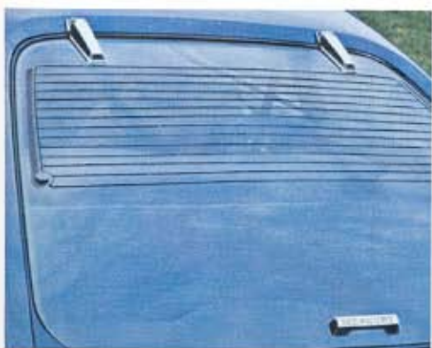
Standard rear window defroster