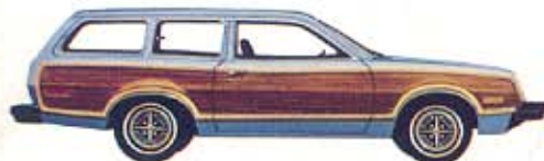
Bobcat Villager Wagon