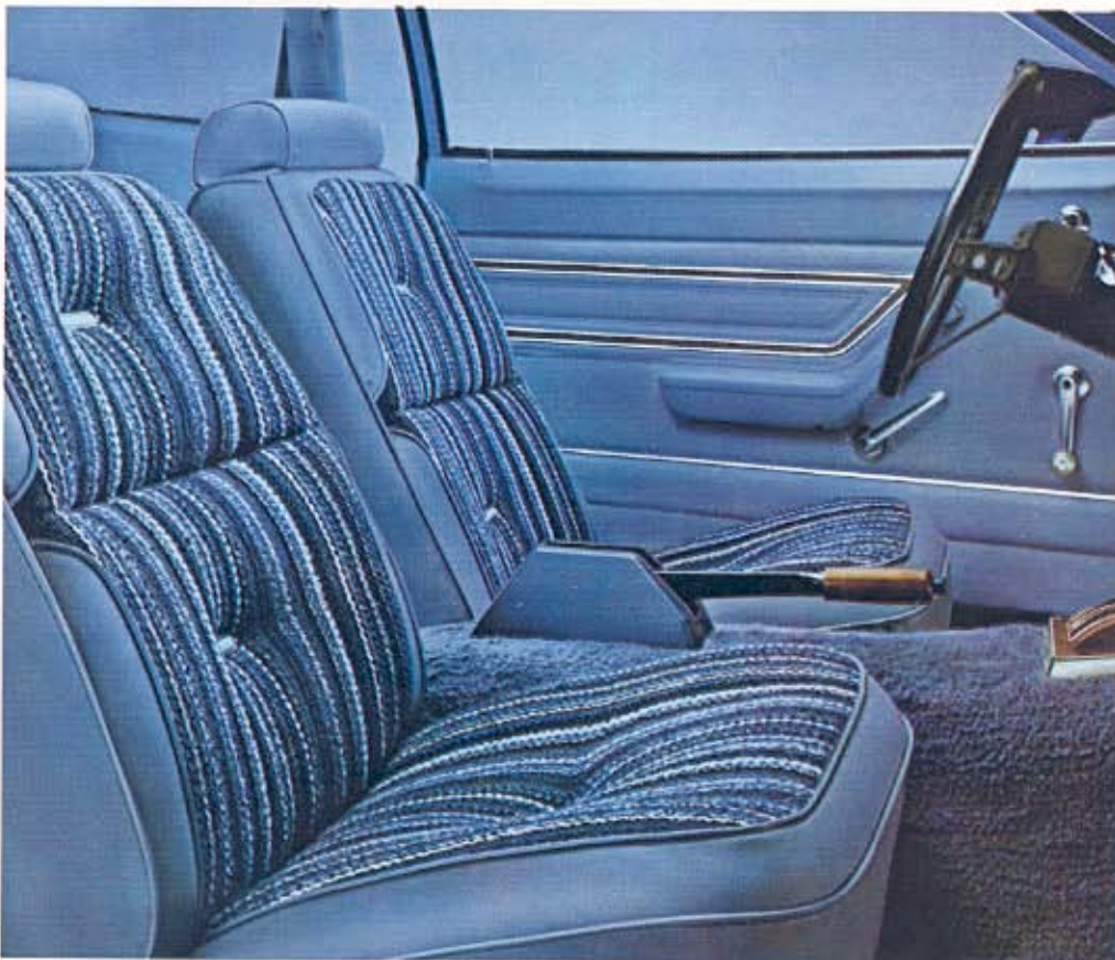
Deluxe interior in Wedgewood blue Scanda cloth—also available in medium red, caramel and Vaquero colors

NEW EXTERIOR FLAIR! To liven up your 1980 Runabout, you can choose between two packages. The Runabout in the foreground features the new Sport Option . It's the sportiest looking Runabout ever! Check the front air dam, racy rear spoiler, sporty paint and tape treatment and optional cast aluminum wheels. Its handsome mate features the Sports Accent Group , shown with the new Tu-tone paint option. It can be distinguished by the tape and paint treatment on the lower bodyside and lower