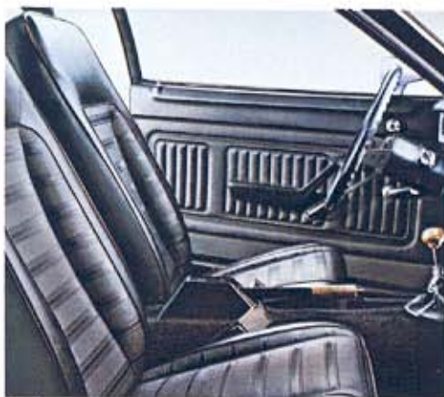
Runabout standard interior in black vinyl

NOTE: Some items are optional. See notable standard features, measurement and color code reference listed throughout this catalog.