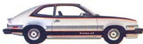
Bobcat Runabout w/Sport Option

Stagger-mounted shock absorbers. To assist control, rear shock absorbers on Bobcat are angle mounted to slant inward. Large rubber bushings are used in mounting the shocks to help control noise and vibration levels.