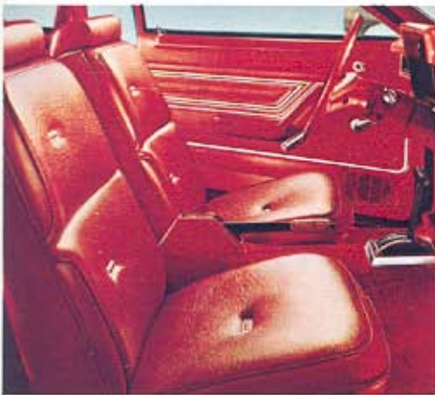
Deluxe interior trim option—also available in light Wedgewood blue, black, caramel and Vaquero colors