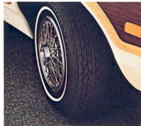
Optional white sidewall steel-belted radial

DRESS YOUR WAGON WITH DESIRABLE OPTIONS. The options pictured